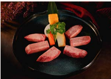
Steak Tan Shio ..... IDR 240 100grams

premium salted beef tongue slices with Welsh leek on top 上葱タン