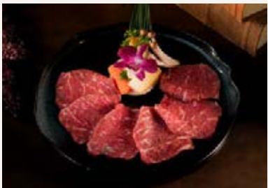
Joo Wagyu Rosu - US ..... IDR 458 130grams

beef short ribs slices with Welsh leek on top 葱カルビ