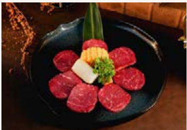
Rosu ..... IDR 217 90grams

marbled sirloin slices with Welsh leek on top 葱ロース