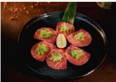
Joo Negi Tan ..... IDR 260 90grams

premium salted beef tongue slices with Welsh leek on top 上葱タン