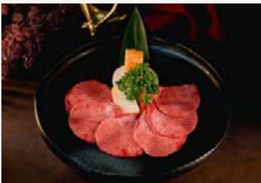
Joo Tan Shio ..... IDR 230 90grams