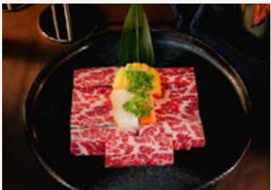
Karubi ..... IDR 325 90grams