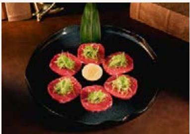
Negi Rosu ..... IDR 228 90grams

marbled sirloin slices with Welsh leek on top 葱ロース