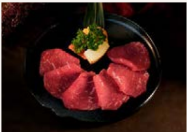
Joo Rosu - US ..... IDR 270 100grams

premium US marbled sirloin slices 米国上和牛ロース