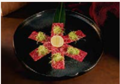
Negi Karubi ..... IDR 298 80grams

beef short ribs slices with Welsh leek on top 葱カルビ