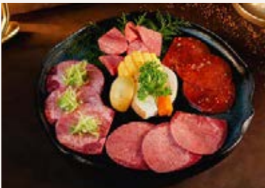
Tan Moriawase ..... IDR 468

premium thick cut of salted beef tongue 上ステーキタン塩