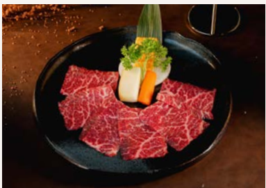
Joo Karubi - US ..... IDR 498 100grams

premium US beef short ribs slices 米国上和牛カルビ