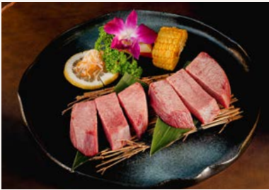
Joo Wagyu Steak Tan Shio ..... IDR 525 110grams

premium thick cut of salted Japanese Wagyu tongue 上和牛ステーキタン塩