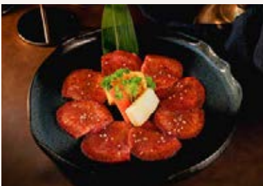
Tan Tare ..... IDR 200 90grams