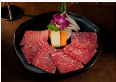
Joo Wagyu Karubi - US ..... IDR 542 130grams

premium US beef short ribs slices 米国上和牛カルビ