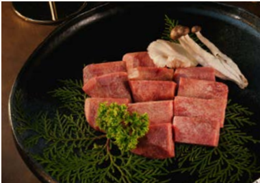
Joo Steak Tan Shio ..... IDR 326 150grams

premium thick cut of salted Japanese Wagyu tongue 上和牛ステーキタン塩