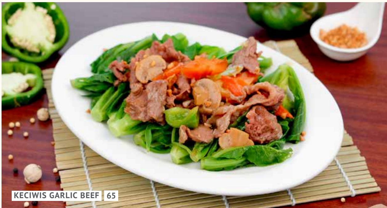
KECIWIS GARLIC BEEF 65

sauteed baby cabbage with garlic sauce, sliced beef, vegetables and crispy fried garlic on top