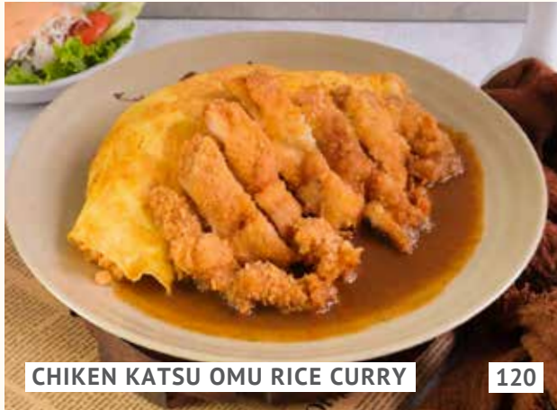
CHIKEN KATSU OMU RICE CURRY