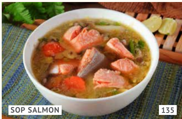
SOP SALMON 135

grilled salmon with dabu-dabu salsa (chopped red chili, shallots, tomatoes, etc) served with soup, fruits, and choice of rice or steamed coconut rice (nasi liwet)