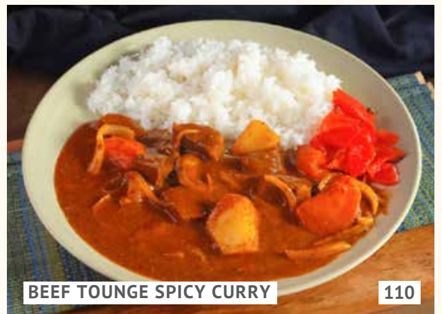
BEEF TOUNGE SPICY CURRY

Indonesian sweet spicy beef tongue coconut milk based stew served with rice