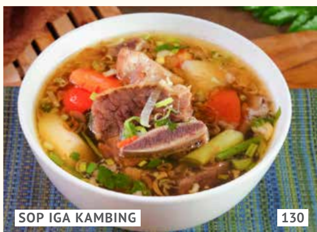
SOP IGA KAMBING

Indonesian sweet spicy lamb coconut milk based stew served with rice