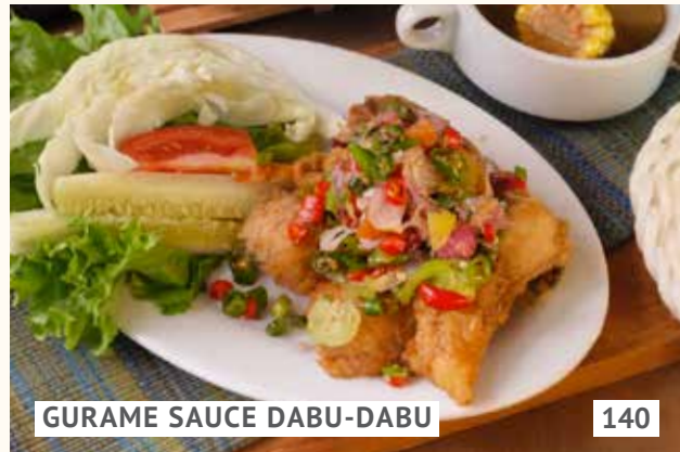
GURAME SAUCE DABU-DABU

deep fried gourami in a sour and spicy broth served with pickles, melinjo crackers, sambal and choice of rice or steamed coconut rice (nasi liwet)