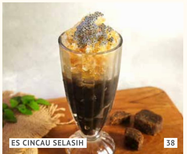
ES CINCAU SELASIH

coconut water and young coconut flesh served with ice