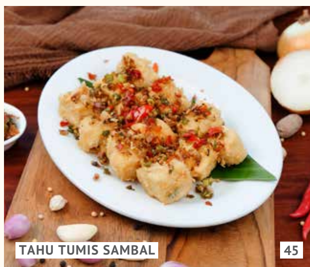
TAHU TUMIS SAMBAL