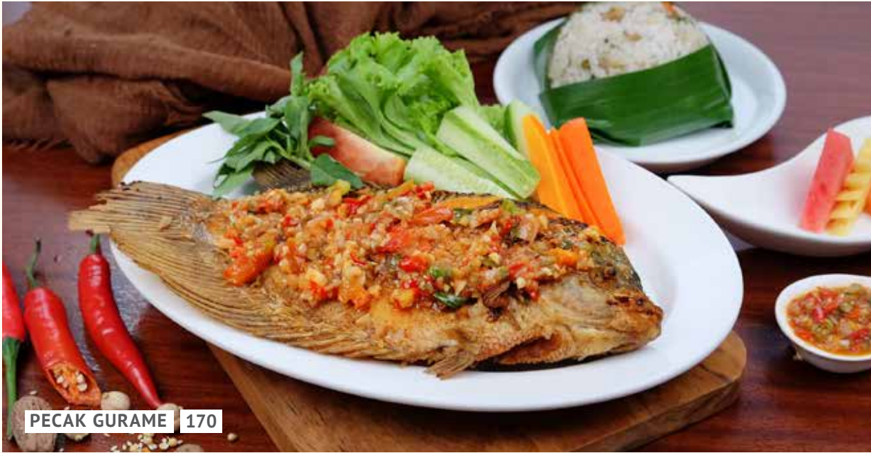
PECAK GURAME 170

deep fried gourami with pecak sambal served with fresh vegetables (lalapan), yellow crackers, fruits and choice of steamed rice or spiced coconut rice (nasi liwet)