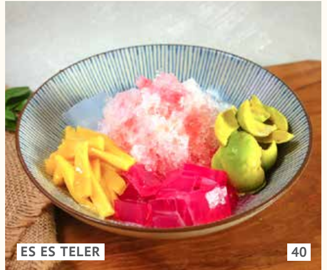
ES ES TELER

Indonesian shaved ice dessert with syrup, condensed milk and various topping