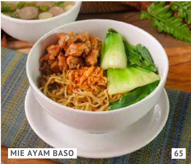
MIE AYAM BASO

sauteed thick udon noodle in red spicy sauce with nori on top