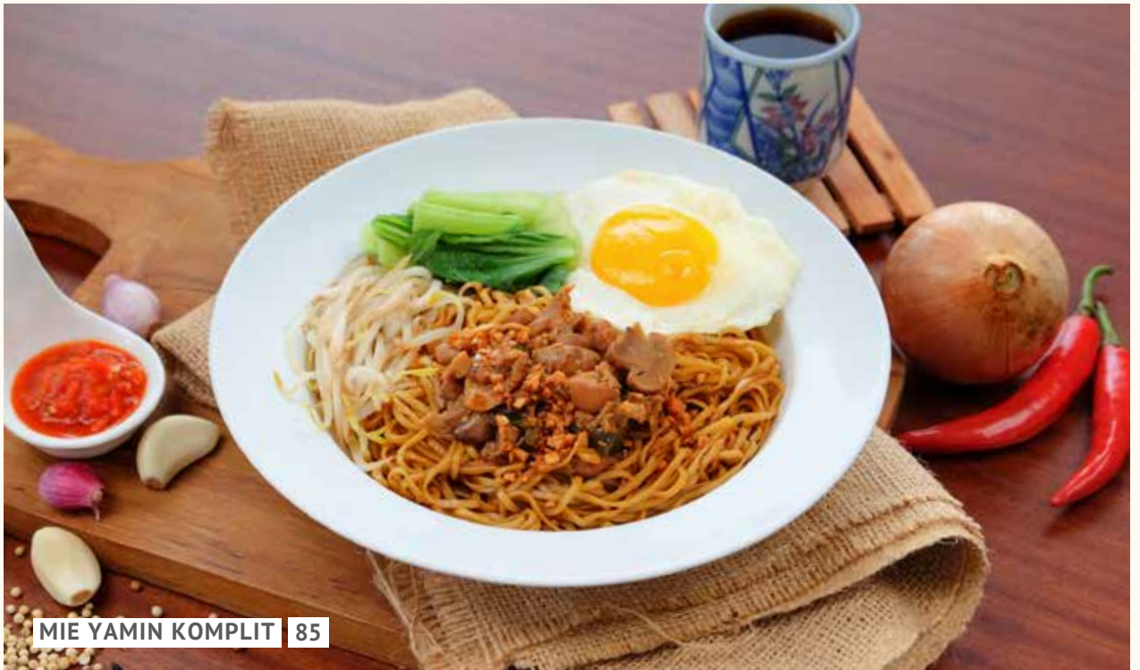
MIE YAMIN KOMPLIT 85

CURRY UDON ..... 85 thick udon noodle with curry soup