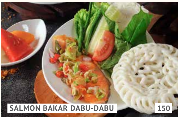
SALMON BAKAR DABU-DABU 150

Indonesian spiced and boiled salmon and tofu in a sour and spicy broth served with pickles, melinjo crackers, sambal, and choice of rice or steamed coconut rice (nasi liwet)