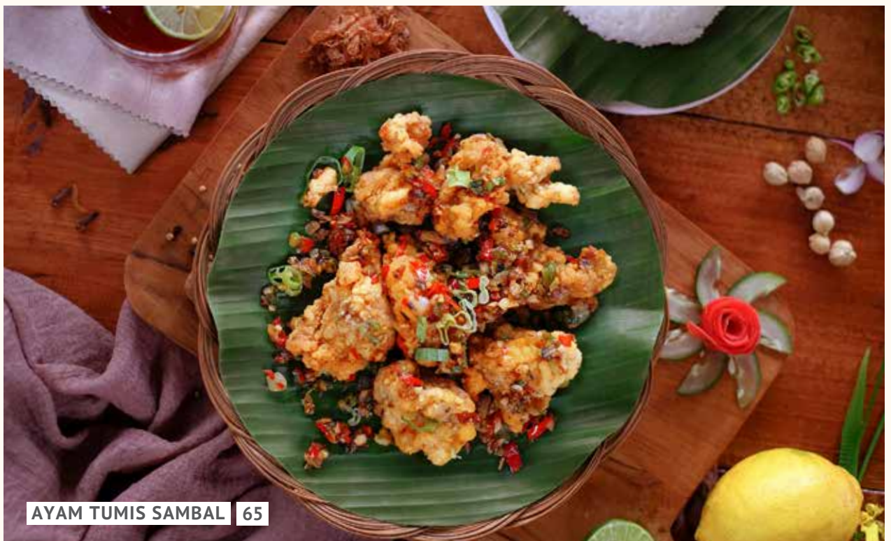
AYAM TUMIS SAMBAL 65

grilled chicken with teriyaki sauce served with rice and miso soup