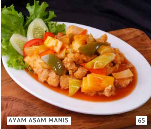
AYAM ASAM MANIS