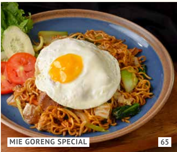
MIE GORENG SPECIAL

Indonesian rice cake, served with coconut milk curry, chicken, ½ soft-boiled egg, and crackers