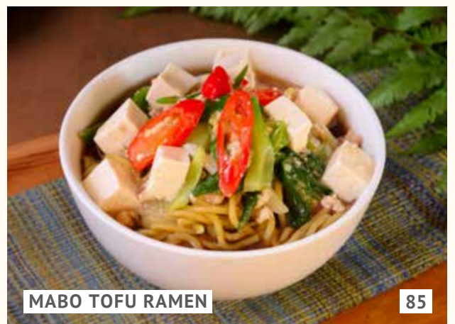
MABO TOFU RAMEN