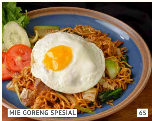
MIE GORENG SPESIAL

cold noodle with sweet sour sauce and vegetables