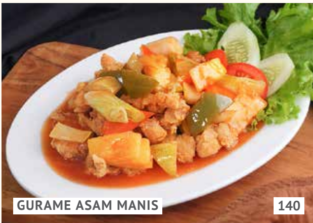
GURAME ASAM MANIS

fried gourami with with dabu-dabu salsa (chopped red chili, shallots, tomatoes, etc) served with soup, fruits, and choice of rice or steamed coconut rice (nasi liwet)