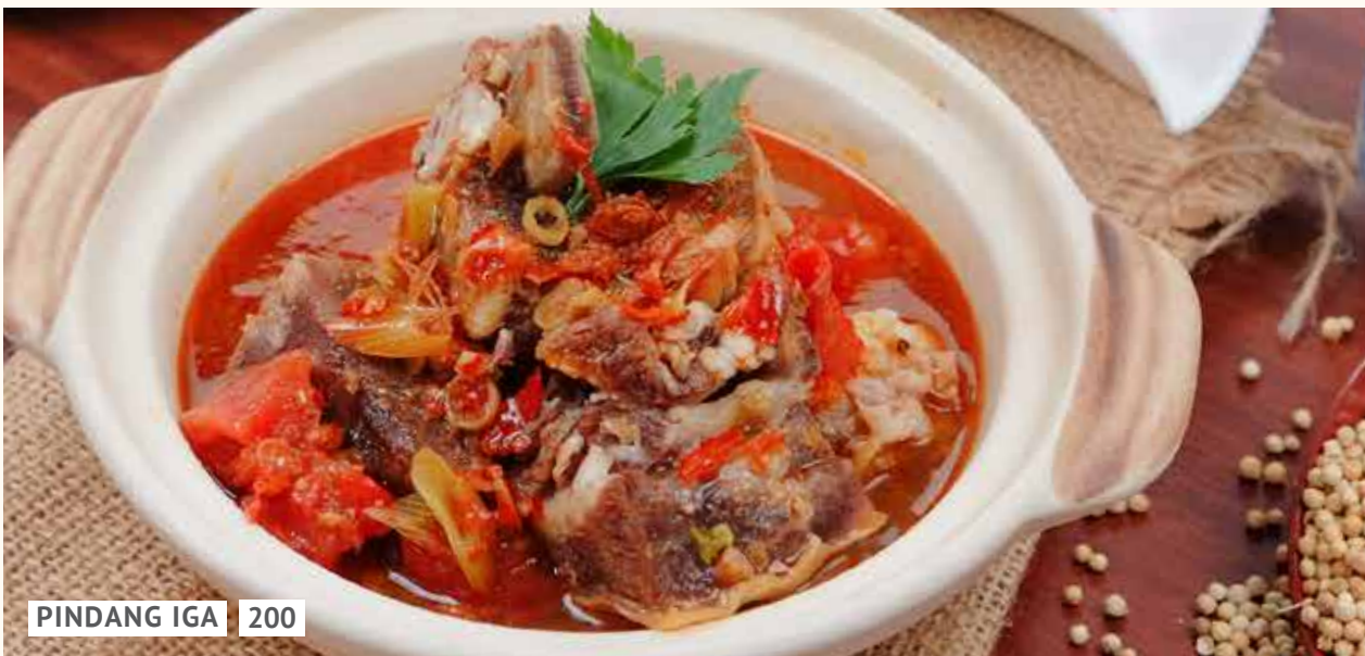
PINDANG IGA 200

NASI GORENG BUNTUT ..... 140 oxtail fried rice