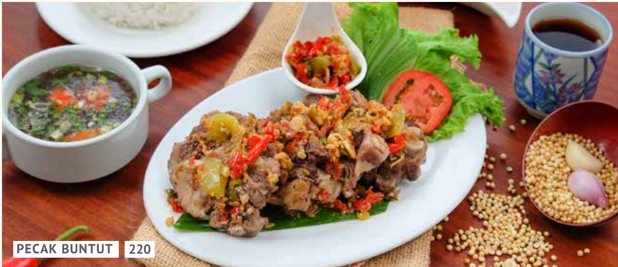
PECAK BUNTUT 220

tender oxtail in pecak sambal (blend of chili, green tomato, shallots, garlic, etc) served with fresh vegetables, crackers, fruits, and choice of rice or steamed coconut rice (nasi liwet)