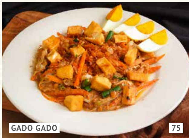
GADO GADO 75

stir fried assorted vegetables with beef