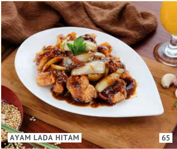
AYAM LADA HITAM

fried chicken with spicy North Sulawesi sambal