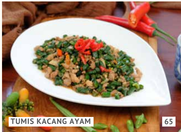
TUMIS KACANG AYAM 65

stir-fried water spinach and various seafood with fermented soybean paste