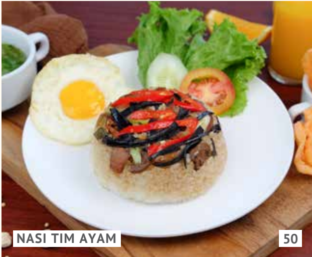
NASI TIM AYAM

a rice porridge topped with crispy chicken and various savory condiments served with yellow soup, yellow crackers, and sambal