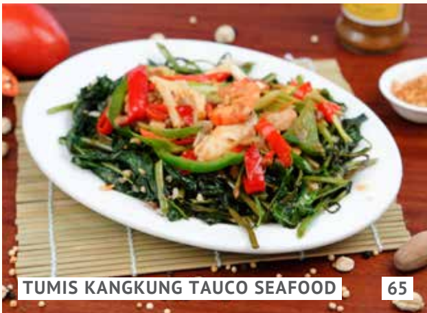
TUMIS KANGKUNG TAUCO SEAFOOD 65

rice served with fried chicken, assorted vegetables and sweet spicy peanut sauce