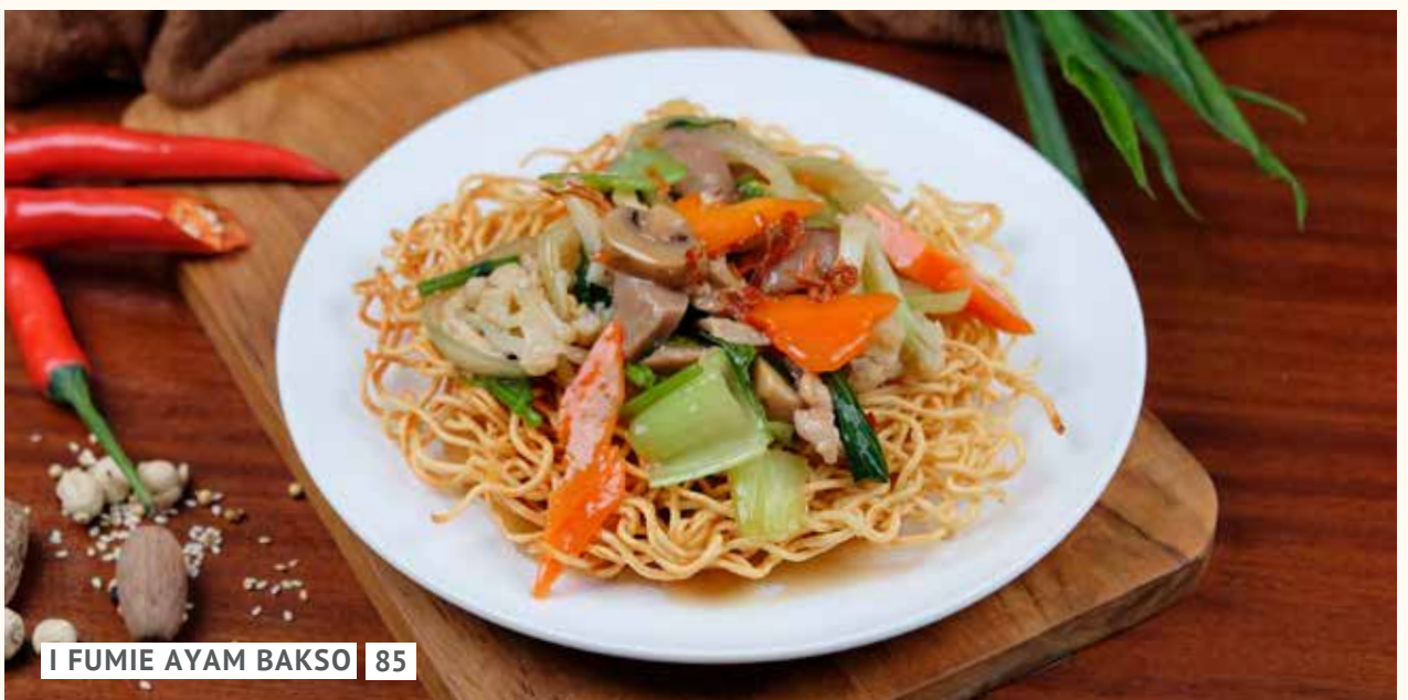
I FUMIE AYAM BAKSO 85

buckwheat noodle/thick udon noodle with tempura