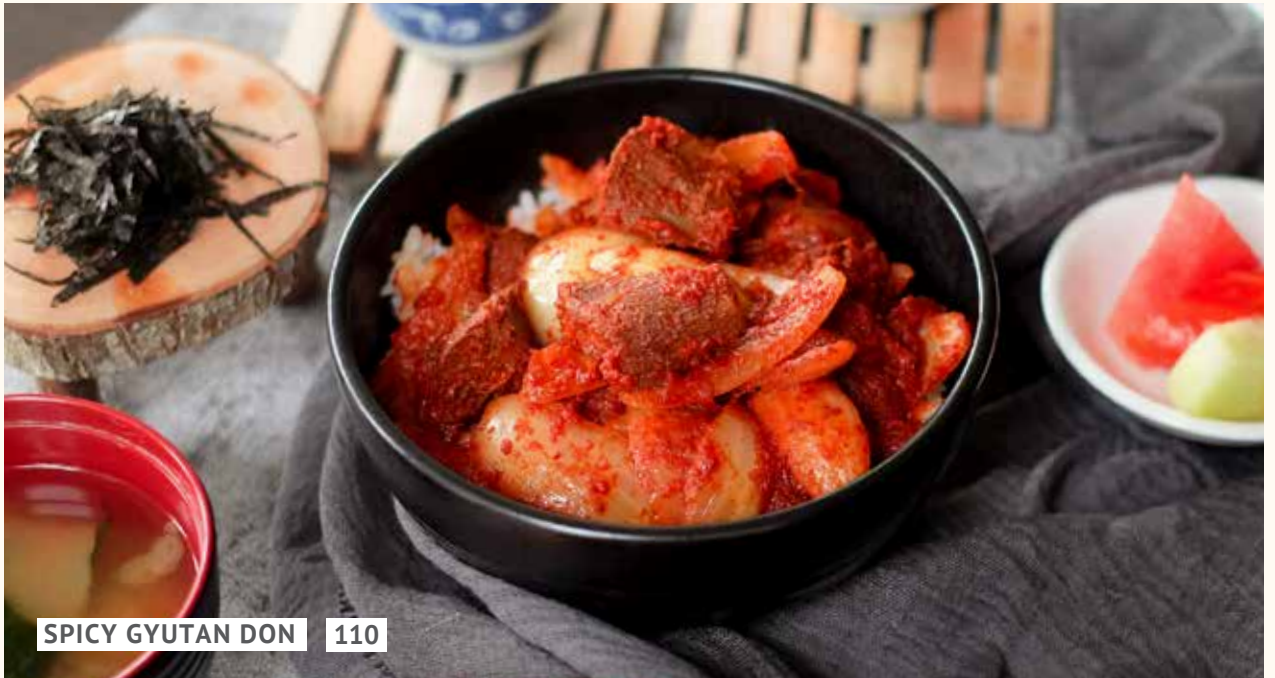
SPICY GYUTAN DON 110

sauteed spicy beef tongue rice bowl served with kimchi, miso soup, and fruits