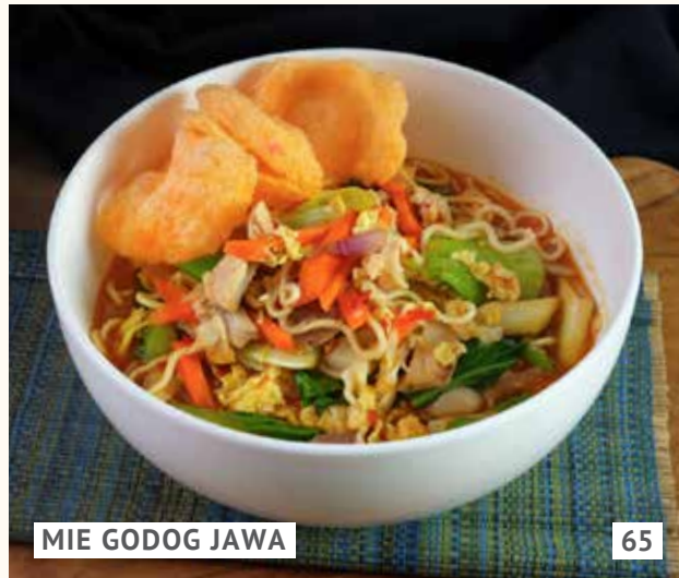
MIE GODOG JAWA

yellow egg noodle, served with diced gravy-braised chicken and chicken broth soup with meatballs, top with spring onion and crispy fried garlic