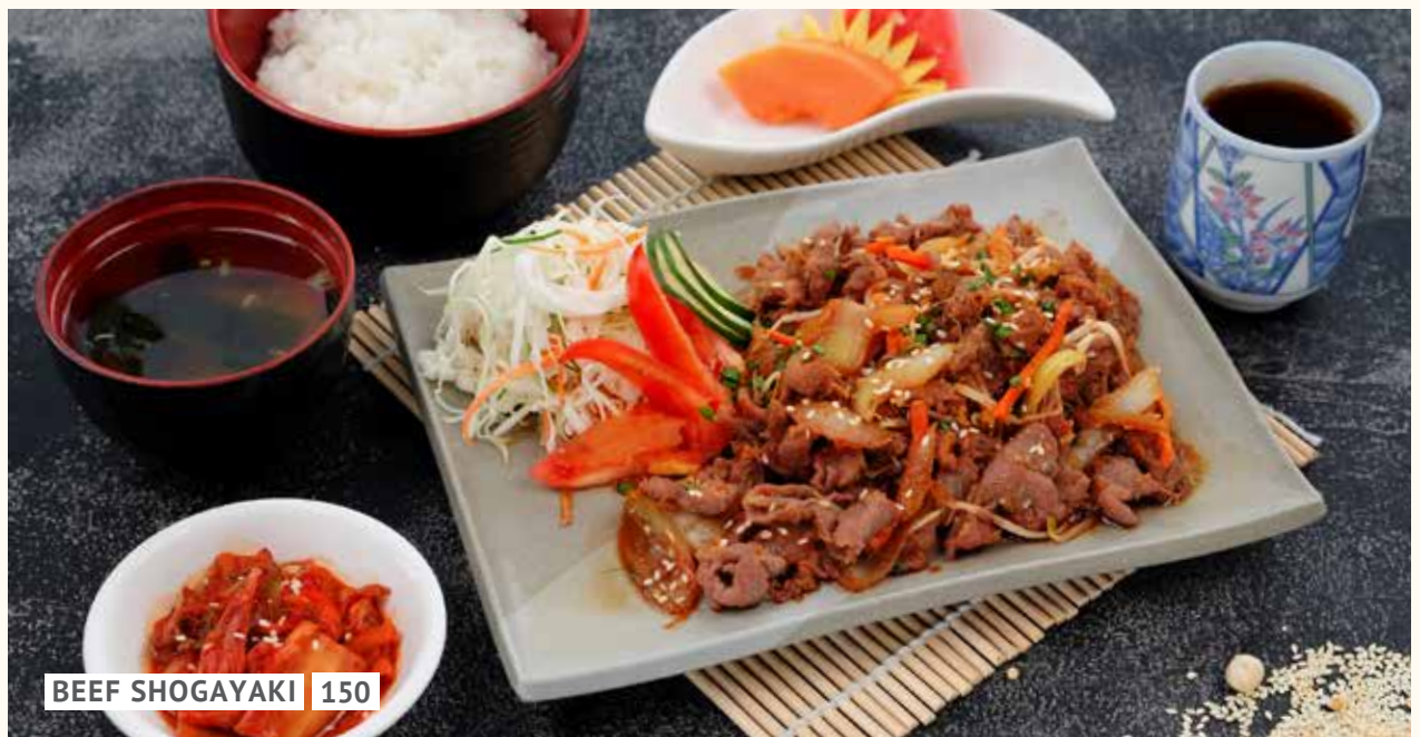
BEEF SHOGAYAKI 150

sauteed thin sliced beef with ginger sauce served with rice, miso soup, kimchi, and fruits