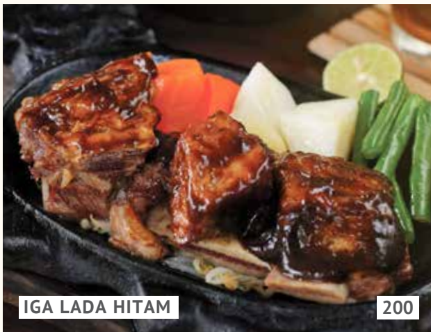
IGA LADA HITAM

tender oxtail in pecak sambal (blend of chili, green tomato, shallots, garlic, etc) served with fresh vegetables, crackers, fruits, and choice of rice or steamed coconut rice (nasi liwet)