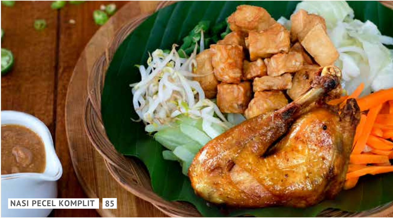
NASI PECEL KOMPLIT 85

rice served with fried chicken, assorted vegetables and sweet spicy peanut sauce