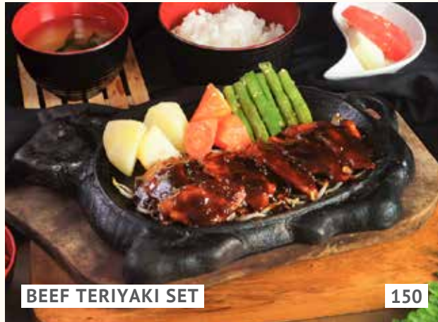
BEEF TERIYAKI SET

dice-cut beef steak served in hot plate with stir-fried vegetables served with rice, kimchi, miso soup, and fruits