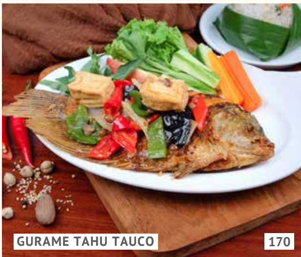
GURAME TAHU TAUCO

carp fish clear soup with spices and vegetables served with rice