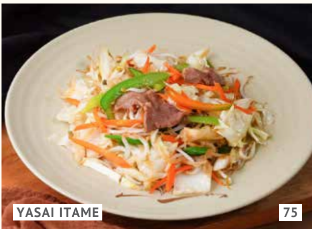
YASAI ITAME 75

stir-fried minced chicken with long beans and chili