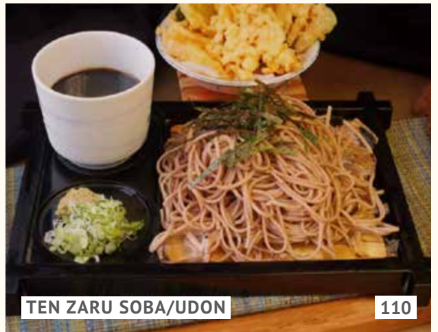
TEN ZARU SOBA/UDON

Korean style thick noodle in a black bean sauce (chunjang) with beef, vegetables and pickled radish