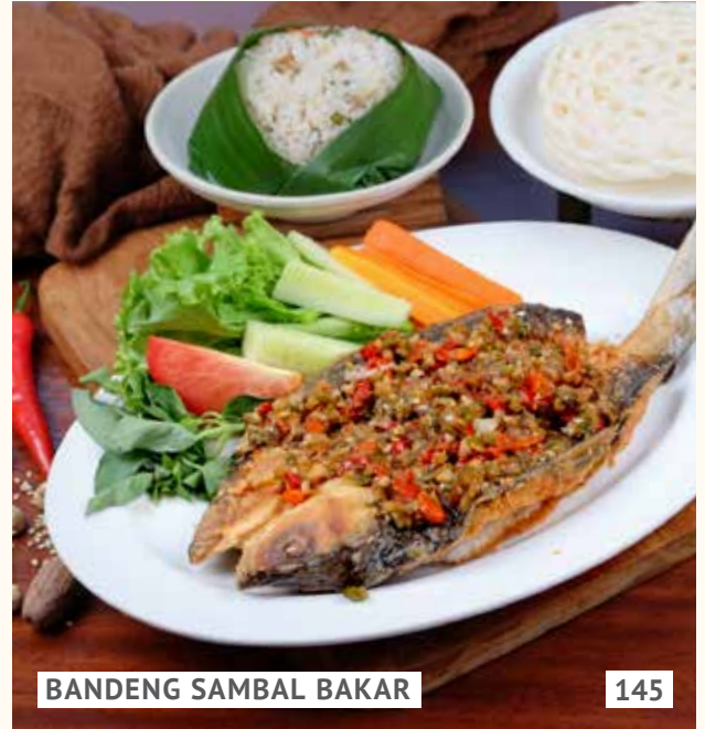
BANDENG SAMBAL BAKAR

fried boneless milkfish in a sour and spicy broth served with pickles, melinjo crackers, sambal and choice of rice or steamed coconut rice (nasi liwet)