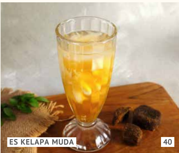
ES KELAPA MUDA

green rice flour jelly with coconut milk and palm sugar syrup