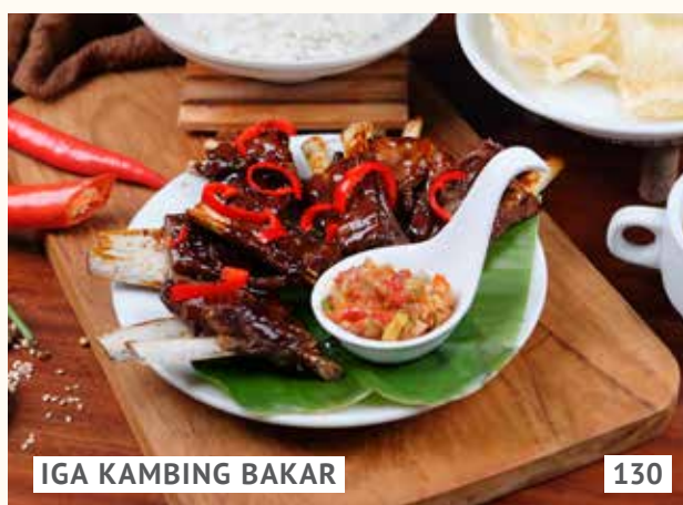
IGA KAMBING BAKAR

lamb ribs soup with spices and vegetables served with rice, pickles, melinjo crackers, and sambal