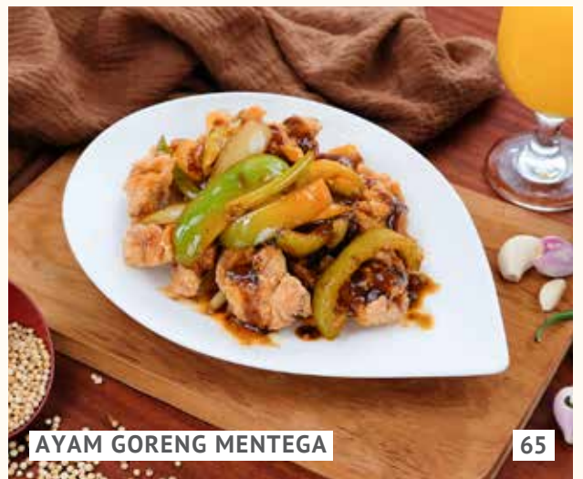
AYAM GORENG MENTEGA

grilled chicken with spicy sauce served with rice, and miso soup