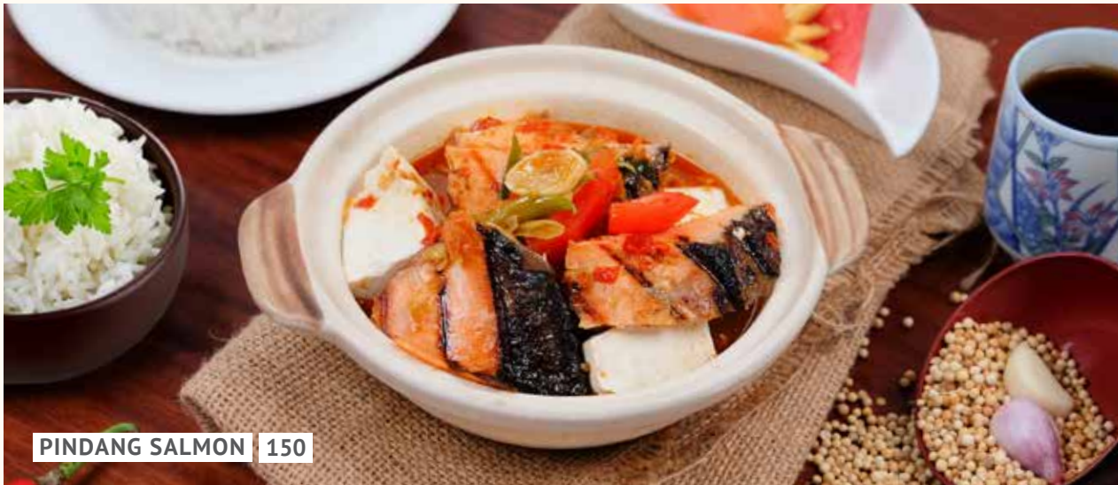
PINDANG SALMON 150

grilled salmon with spicy Manado sambal served with soup, fruits and choice of steamed rice or spiced coconut rice (nasi liwet)