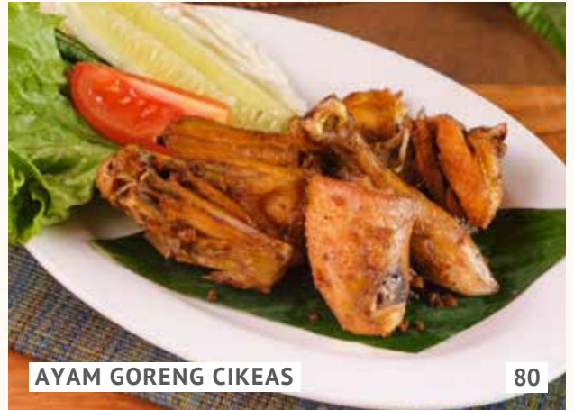
AYAM GORENG CIKEAS

omelette wrapped fried rice served with salad, deep fried chicken cutlets, and curry