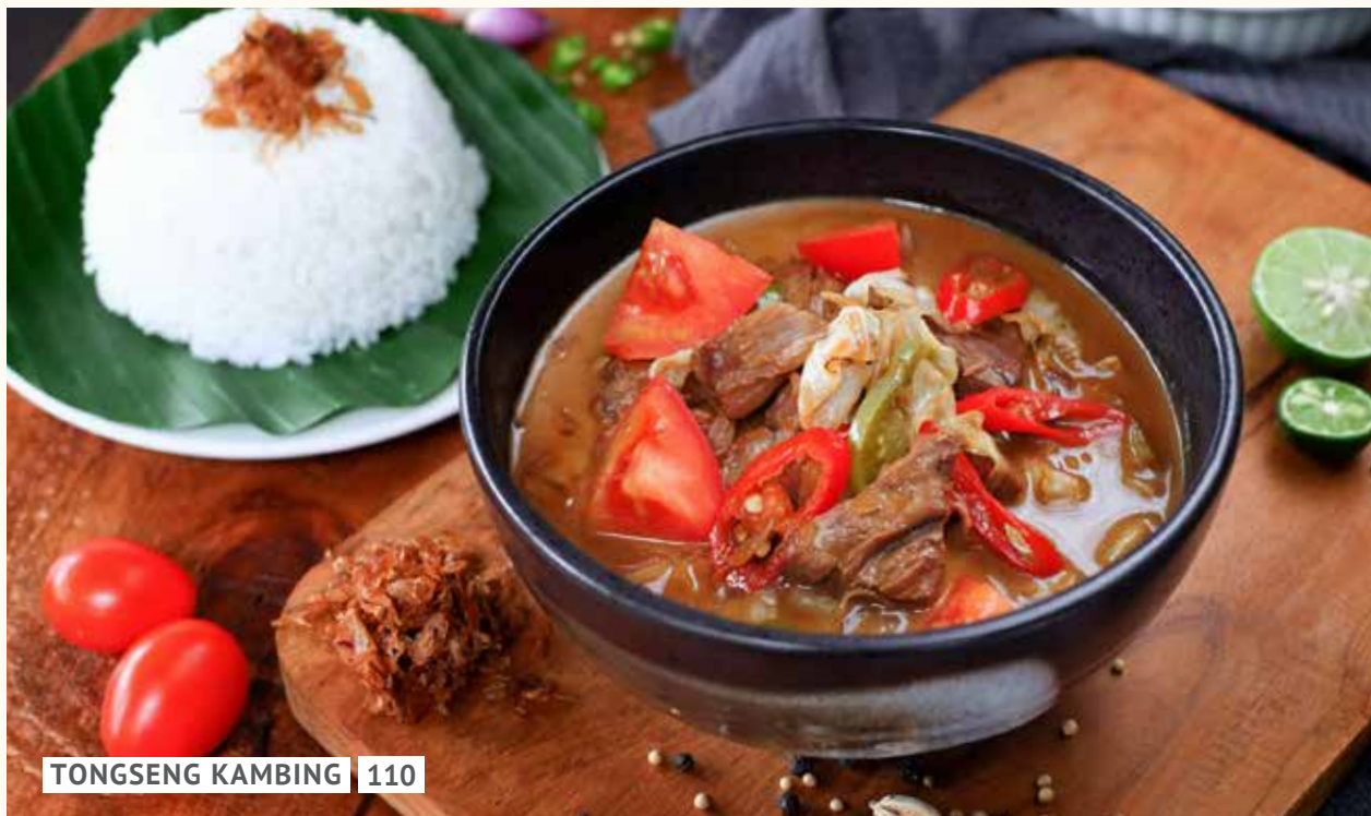
TONGSENG KAMBING 110

SOTO KAMBING ..... 130 Indonesian style lamb soup with various vegetables topping served with rice