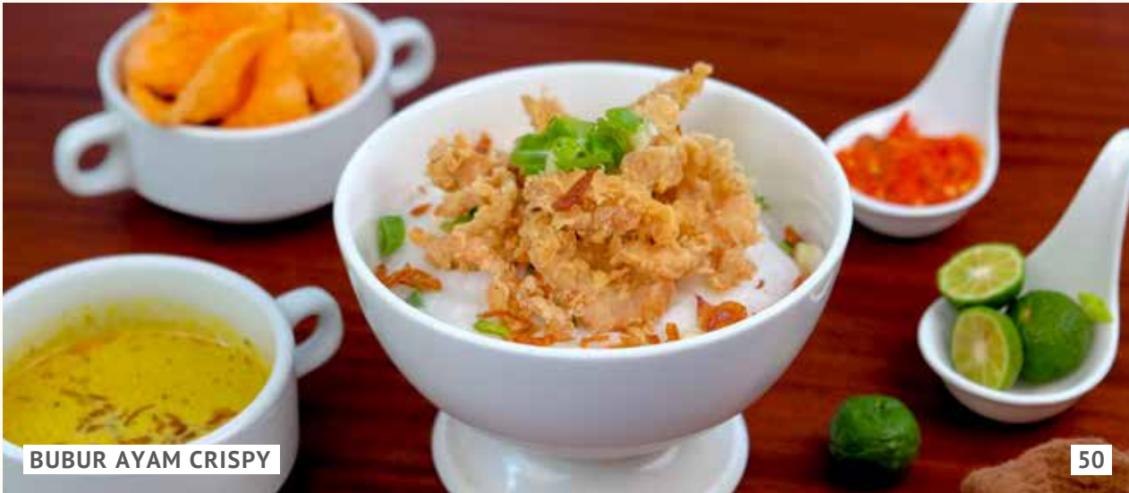
BUBUR AYAM CRISPY