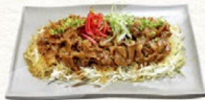
Buta Miso Yaki 90 ++ 豚味噌焼き sauteed pork with miso