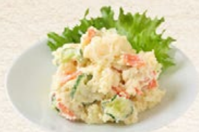
Potato Salad 40** ポテトサラダ