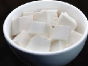
豆腐 Tofu Add 10.000 ++