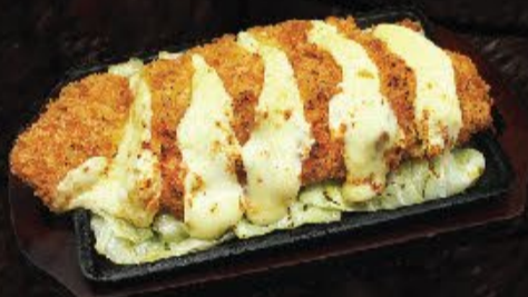
Milu Katsu ミルカツ Original Hot Plate 120 ++ With Cheese 135 ++

crispy deep fried pork mille-feuille cutlets hot plate