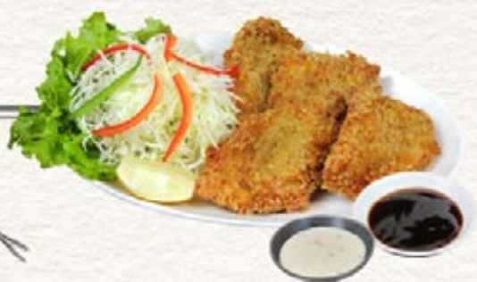
Aji Furai 75** 鯖フライ