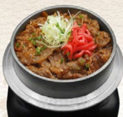
Buta Miso 100** 豚味噌 pork with miso paste