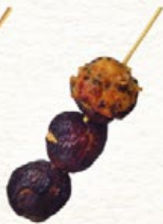
Shiitake Tsukune 椎茸つくね meatloaf with shiitake 30**