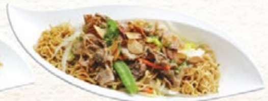
Beef Yakisoba 85** ビーフ焼きそば