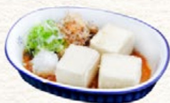
Agedashi Tofu 45++ 揚げ出し豆腐 deep fried tofu with cornstarch in oriental sauce