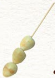
Uzura Tamago うずら卵 quail eggs 20**