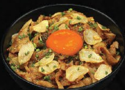
Buta Stamina Don 115 ++ Tare (Sweet) or Shio (Salty) Flavor 豚スタミナ丼

sauteed pork rice bowl topped with garlic and raw egg