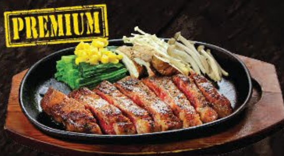
Tokusen Wagyu Sirloin 495 ++ 特選和牛サーロイン

sauteed beef rice bowl topped with garlic and raw egg