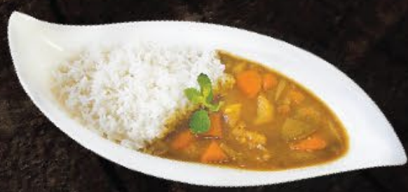
Beef Karubi Curry Original 160 ++ Spicy 165 ++ ビーフカルビカレー

beef meatloaf patty steak with cheese and vegetables