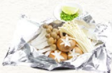
Kinoko Foil - Yaki 65** きのこホイル焼き