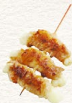
Buta Cheese 豚チーズ pork wrapped cheese 35**