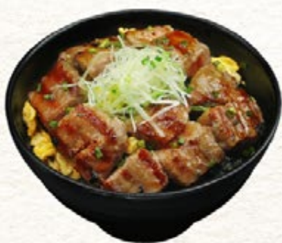
Karubi Don 135** カルビ丼

grilled beef galbi with teriyaki sauce rice bowl