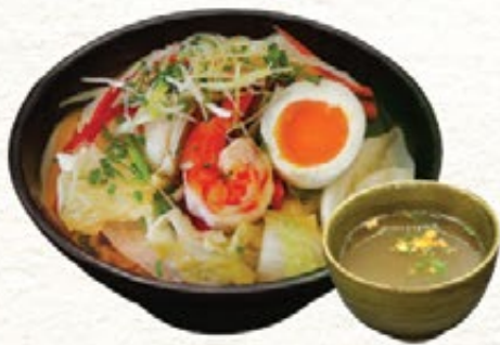
Gomoku Tsukemen 82** 五目つけ麺

noodles with chicken, seafood and vegetables served with dipping soup