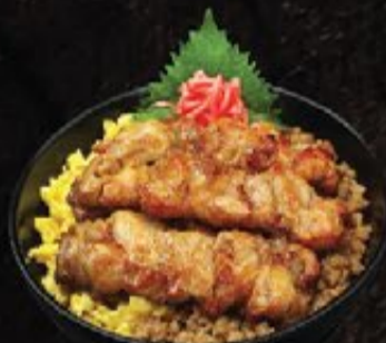
Chicken Teri Don 110** チキン照り丼

grilled chicken and egg mixture on top of rice