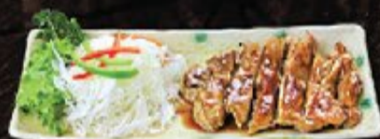
Chicken Teriyaki 100** チキン照り焼き

grilled chicken with original teriyaki sauce