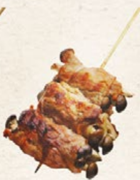
Gyu Kinoko 牛きのこ beef wrapped mushroom 47**