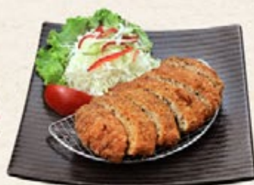
Buta Menchi Katsu 95 ++ 豚メンチカツ deep fried minced pork cutlet