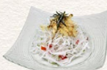
Daikon Salad 45** 大根サラダ