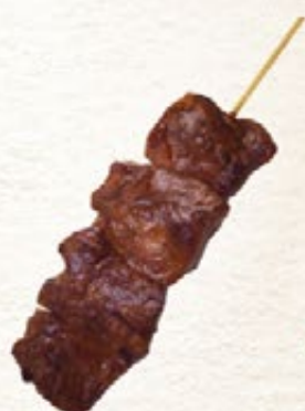
Wagyu Karubi 和牛カルビ marinated Japanese galbi 85**