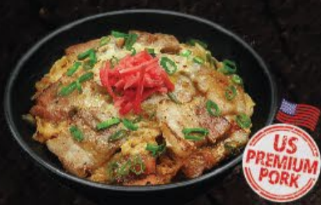
Buta Tama Oyako Don 135 ++ 豚玉親子丼