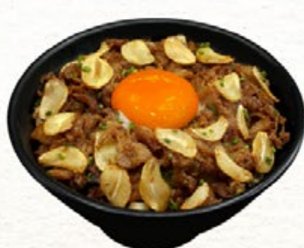
Beef Stamina Don 115** ビーフスタミナ丼

sauteed beef rice bowl topped with garlic and raw egg