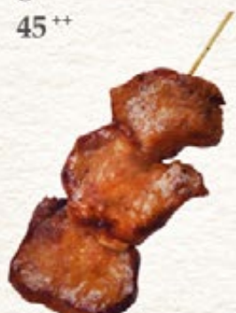
Gyutan Thick 牛タン厚切り thick sliced tongue 63**