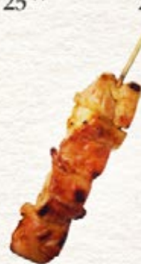
Sasami ささみ chicken tenderloin 26**