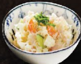
ポテトサラダ Potato Salad