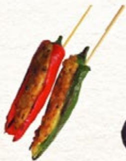
Cabe Tsukune チャベつくね chili wrapped meatloaf 25**