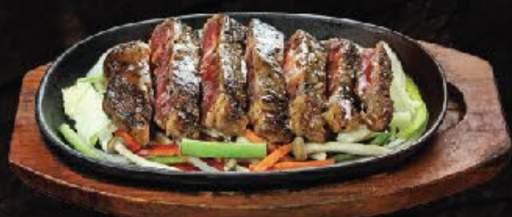
Aust. Beef Steak 245 ++ オーストラリアビーフステーキ