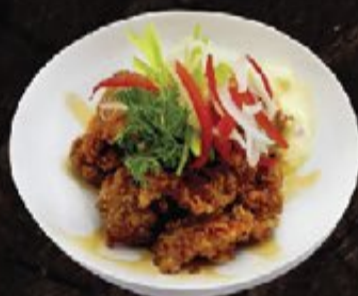
Tori Namban 95** 鶏南蛮

deep fried chicken glazed with vinaigrette dressing