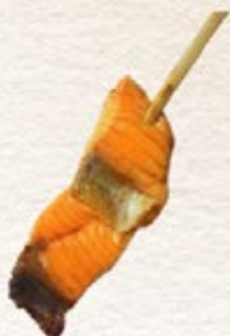
Sake 鮭 salmon 47**