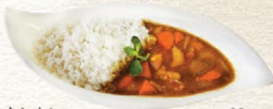
チキンカレー Original 92** Chicken Curry Spicy 97**

Japanese chicken curry with vegetables and rice