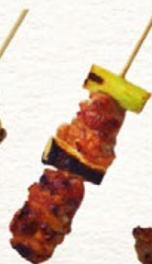
Negima ねぎま leeks & meat 25**