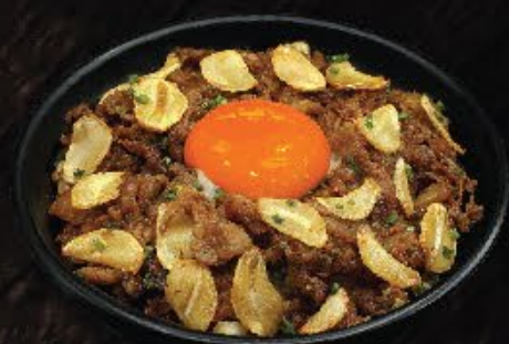
Beef Stamina Don 125 ++ ビーフスタミナ丼

sauteed beef rice bowl topped with garlic and raw egg