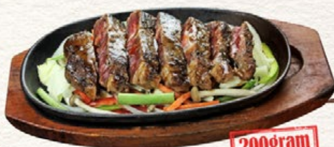
Tokusen Wagyu Chuck Roll