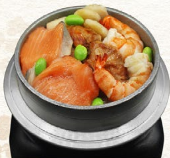
Gomoku 五目 120** salmon, prawn, scallop, chicken

Traditional Japanese rice dish cooked in iron pot Cooking time varies depends on restaurant situation. Please kindly ask our staffs