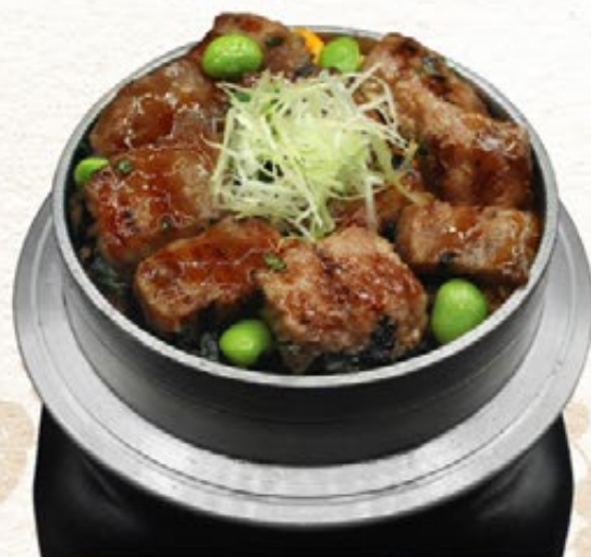
Karubi カルビ 135** boneless short rib