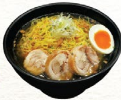
Tori Ramen 72** 鶏ラーメン

noodles with chicken, seafood and vegetables served with dipping soup