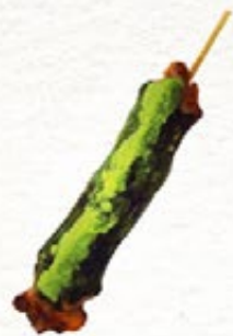
Momo Wasabi Shisomaki ももわさびしそ巻き leg meat wrapped in shiso leaf with wasabi 27**