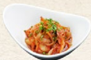
Kimchi 40++ キムチ home-made Korean pickles