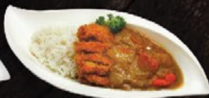
Chicken Katsu Curry Original 108** Spicy 113**

Japanese chicken curry with vegetables and rice