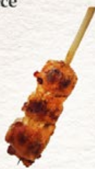
Buta Tomato 豚トマト pork wrapped tomato 35**