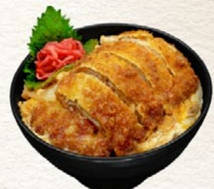
Chicken/Buta Katsu Don 100**/105** チキン・豚カツ丼

sauteed chicken rice bowl topped with garlic, vegetables and raw egg