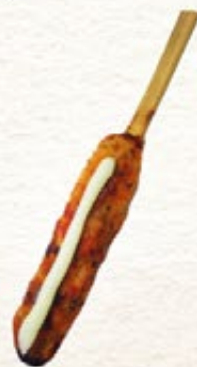
Tsukune Mayo つくねマヨネーズ meatloaf mayonnaise 27**