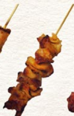
Kawa 皮 skin 20**