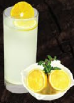
NAMA SHIBORI LEMON CHUHAI