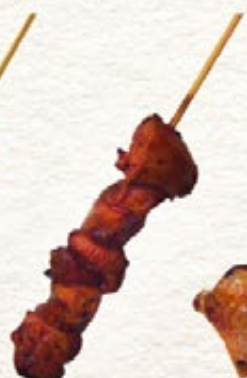
Liver レバー liver 20**