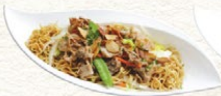
Buta Yakisoba 85** 豚焼きそば

spicy red soup noodles with chicken chashu and egg