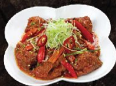
Tori Chili Itame 95** 鶏チリ炒め

deep fried chicken glazed with vinaigrette dressing