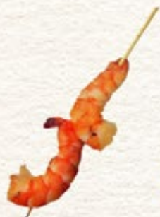
Ebi 海老 shrimp 44**