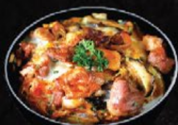
Aburi Oyako Don 110** 炙り親子丼

grilled chicken and egg mixture on top of rice