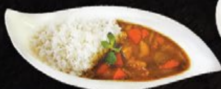
Chicken Curry Original 102** Spicy 107**

grilled chicken with original teriyaki sauce