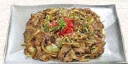
Buta Shogayaki 93 ++ 豚生姜焼 sauteed pork with ginger