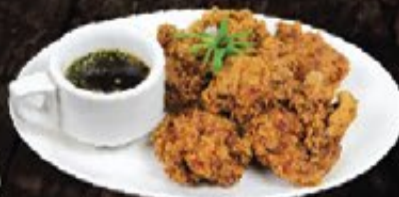
Chicken Karage 95** チキン唐揚げ

crispy deep fried chicken cutlets with Japanese curry and rice