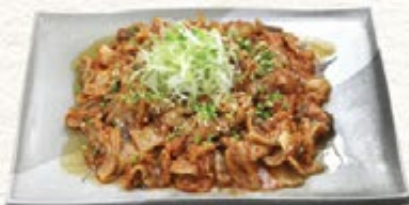
Buta Kimchi Itame 93 ++ 豚キムチ炒め sauteed pork with kimchi