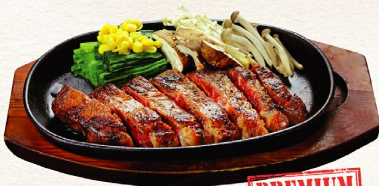
Tokusen Wagyu Sirloin Sumibiyaki