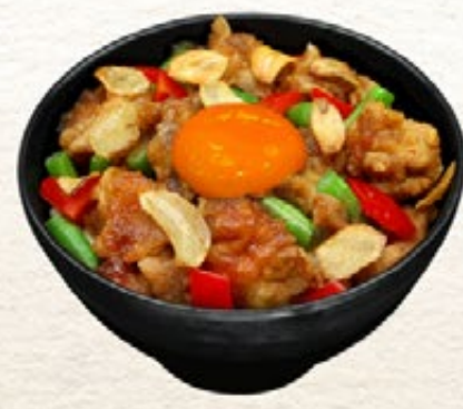
Chicken Stamina Don 100** チキンスタミナ丼

sauteed chicken rice bowl topped with garlic, vegetables and raw egg