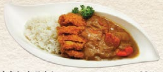
チキンカツカレー Original 98** Chicken Katsu Curry Spicy 103**

Japanese chicken curry with vegetables and rice