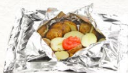
Jaga Bata Mentaiko 70** じゃがバター明太子

broiled potato & butter with cod roe wrapped in foil