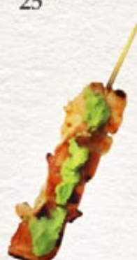
Sasami Wasabi ささみわさび chicken tenderloin wasabi 27**