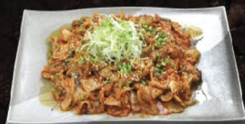
Buta Kimchi Itame 118 ++ 豚キムチ炒め