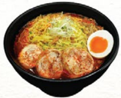
Aka Kara Ramen 82** 赤辛ラーメン

clear soup noodles with chicken chashu and egg