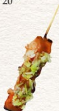
Sasami Negi Miso ささみ ネギ味噌 chicken tenderloin leeks and miso 27**