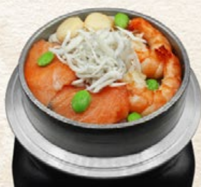
Kaisen 120** 海鮮 salmon, prawn, scallop topped with anchovies