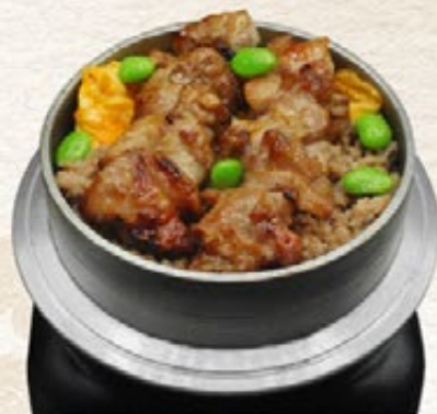
Tori Zanmai 90** 鶏三昧 sweet marinated chicken