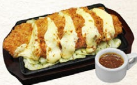
Milu Katsu ミルカツチーズ original hot plate with cheese 95 ++ 110 ++

crispy deep fried pork mille-feuille cutlet hot plate