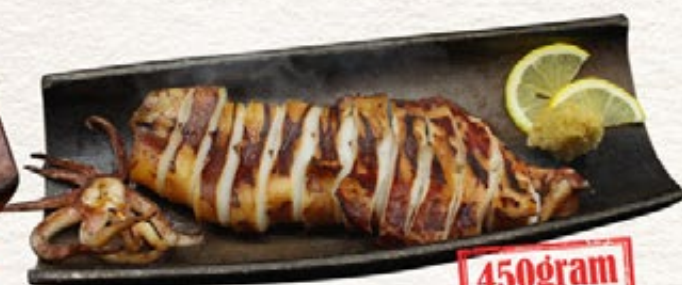
Oo Ika Maruyaki / Big Squid Sumibiyaki