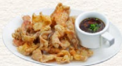
Tori Kawa Senbei 47++ 鶏皮煎餅 〈おろしポン酢添え〉 deep fried chicken skin with "oroshi pon-zu" sauce