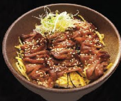
Gyutan Don 165 ++ 牛タン丼

sauteed beef galbi with garlic soy sauce rice bowl