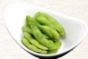
Edamame 37++ えだまめ boiled soy beans