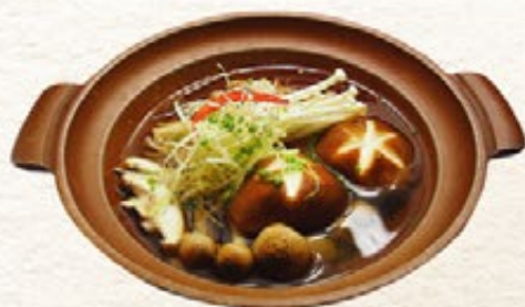
Tori Tsumire Kinoko Soup 72** 鶏つみれキノコスープ

deep fried chicken glazed with vinaigrette dressing