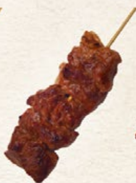
Karubi カルビ marinated galbi 45**