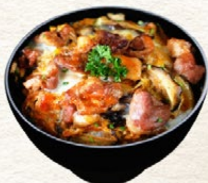
Aburi Oyako Don 100** 炙り親子丼

sauteed beef rice bowl topped with garlic and raw egg