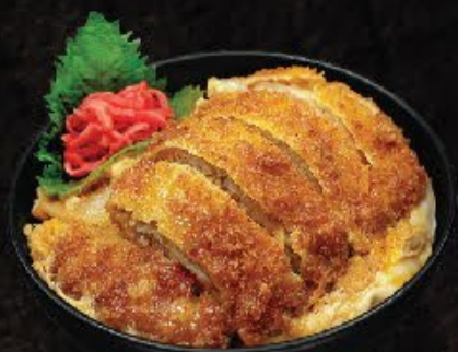
Buta Katsu Don 115 ++ 豚カツ丼

sauteed pork rice bowl topped with garlic and raw egg