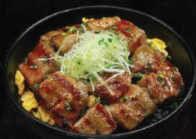
Karubi Don 145 ++ カルビ丼

sauteed beef galbi with garlic soy sauce rice bowl