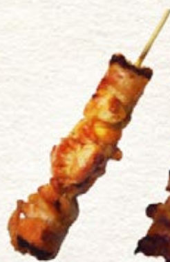
Momo もも leg meat 25**