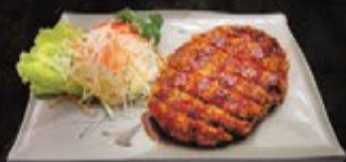
Chicken Menchi Katsu 100** チキンメンチカツ

deep fried chicken glazed with chili sauce