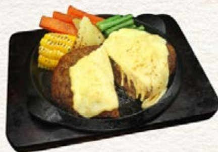
Beef Hamburg with Cheese 105 ++ ビーフハンバーグ・チーズ beef meatloaf patty steak with cheese and vegetables

All price mentioned are in Rp 1.000,- All price are subject to service charge and government tax