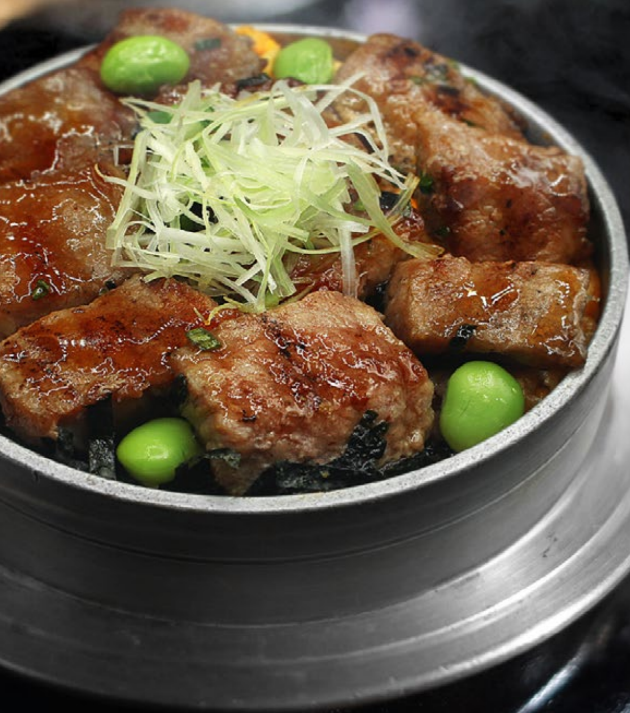
Karubi Kamameshi カルビ釜飯