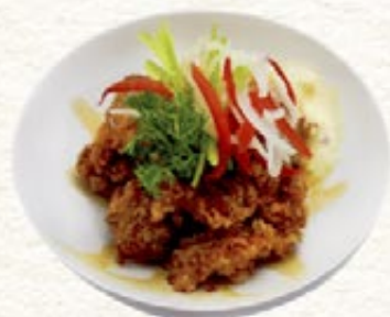
Tori Namban 70** 鶏南蛮

deep fried chicken glazed with vinaigrette dressing