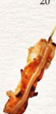
Sasami Ume ささみ 梅ソース chicken tenderloin plum sauce 27**