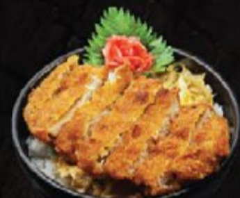
Chicken Katsu Don 110** チキンカツ丼

grilled chicken and garlic on top of rice