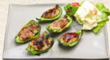
Piman Tsukune 60** ピーマンつくね

bell pepper stuffed with chicken meatloaf