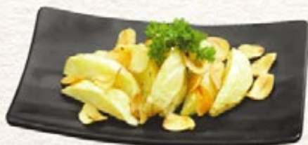
Garlic Fried Potato 50++ ガーリックフライドポテト potato with garlic