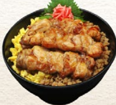
Chicken Teri Don 100** チキン照り丼

grilled chicken and egg mixture rice bowl