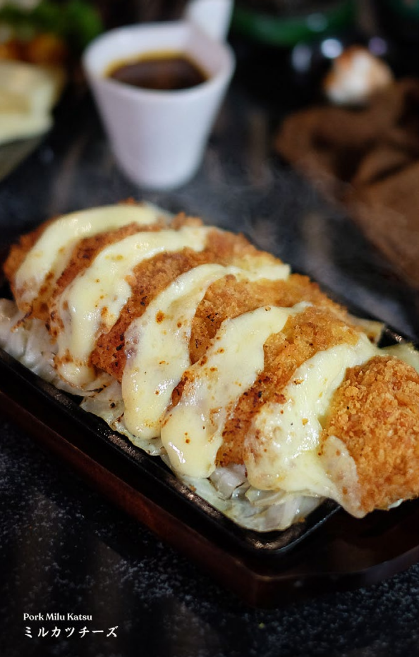
Pork Milu Katsu ミルカツチーズ