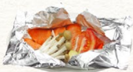
Salmon Foil - Yaki 70** サーモンホイル焼き