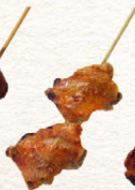
Tebasaki 手羽先 wings 20**