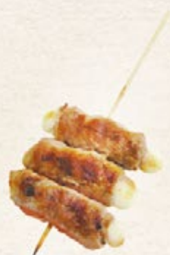
Gyu Cheese 牛チーズ beef wrapped cheese 47**