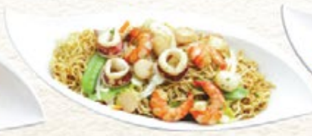
Kaisen Yakisoba 85+ 海鮮焼きそば