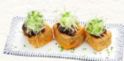
Atsuage 45++ 厚揚げ〈鶏味噌あんかけ〉 deep fried tofu cubes with miso sauce topping