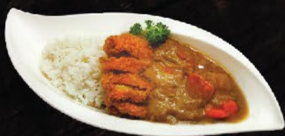
Buta Katsu Curry Original 125 ++ Spicy 130 ++ 豚カツカレー

crispy deep fried pork cutlets with Japanese curry and rice