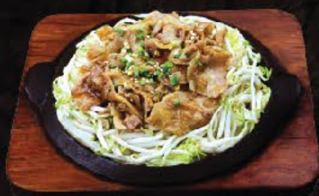
Beef Moyashi Itame 105 ++ ビーフ萌やし炒め