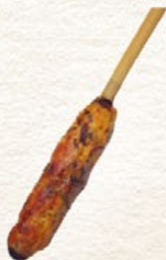
Tsukune つくね chicken meatloaf 25**