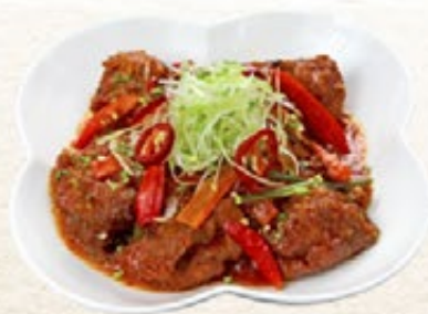
Tori Chili Itame 70** 鶏チリ炒め

deep fried chicken glazed with chili sauce