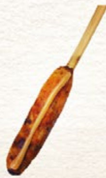
Tsukune Ume つくね梅ソース meatloaf plum sauce 27**