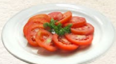
Tomato Slice Salad 40** トマトスライスサラダ