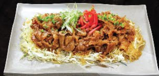
Beef Miso Yaki 105 ++ ビーフ味噌焼き