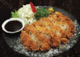
Chicken Katsu 100** チキン