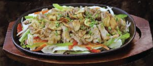
Buta Yasai Itame 105 ++ 豚野菜炒め

crispy deep fried pork mille-feuille cutlets hot plate