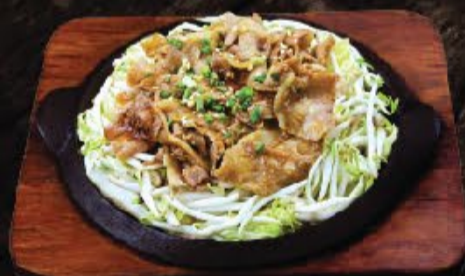
Buta Moyashi Itame 105 ++ 豚萌やし炒め

crispy deep fried pork cutlets with Japanese curry and rice