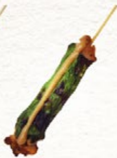
Momo Ume Shisomaki もも梅しそ巻き leg meat wrapped in shiso leaf with plum sauce 27**