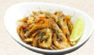
Koebi Pepper Fry 60++ 小海老ペッパーフライ fried shrimp with pepper