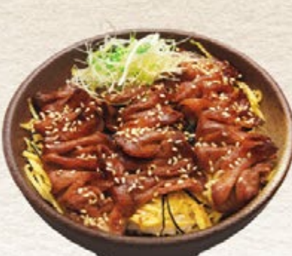
Gyutan Don 155** 牛タン丼

crispy deep fried chicken/pork rice bowl