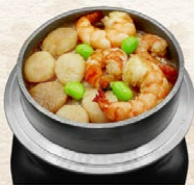
Hotate Ebi Butter 120** 帆立海老バター scallop and shrimp with butter