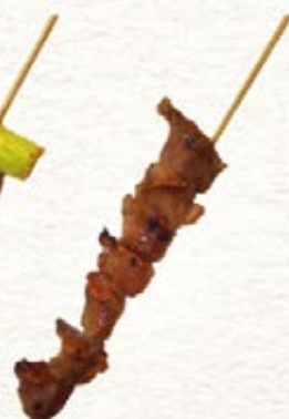
Sunagimo 砂肝 gizzard 20**