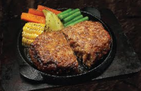
Beef Hamburg 120 ++ ビーフハンバーグ

beef meatloaf patty steak with vegetables