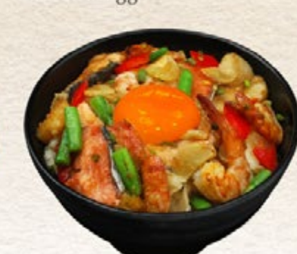
Seafood Stamina Don 112** 海鮮スタミナ丼

sauteed seafood rice bowl topped with garlic, vegetables and raw egg