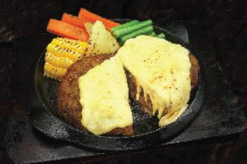
Beef Hamburg with Cheese 130 ++ ビーフハンバーグチーズ

beef meatloaf patty steak with vegetables