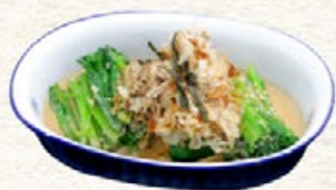
Horenso Ohitashi 48** ほうれん草お浸し