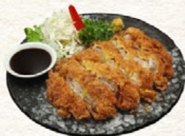
Chicken Katsu 75** チキンカツ

deep fried chicken glazed with chili sauce