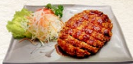
Chicken Menchi Katsu 75** チキンメンチカツ