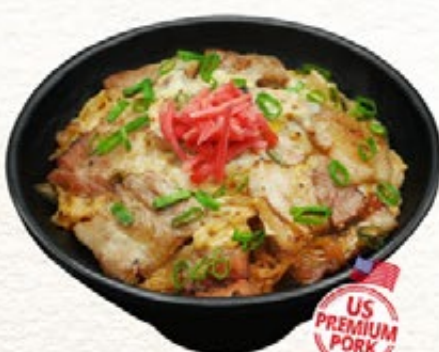
Buta Tama Oyako Don 125** 豚玉親子丼

grilled beef galbi with teriyaki sauce rice bowl