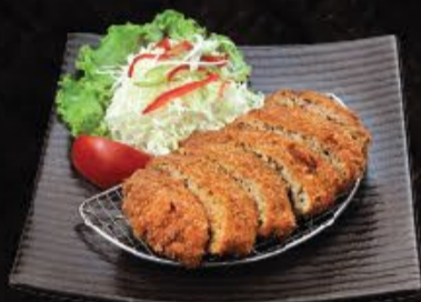
Buta Menchi Katsu 120 ++ 豚メンチカツ