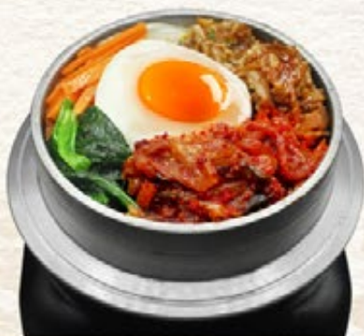
Bibimbap 90** ビビンバ korean mixed rice of beef and vegetables