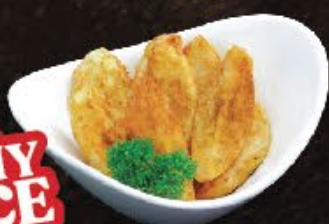
フライドポテト Fried Potato