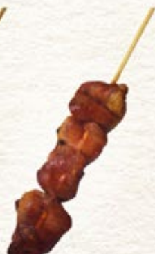
Hatsu ハツ heart 20**