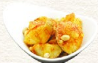
Kado Potato 50++ 門ポテト fried spicy potato