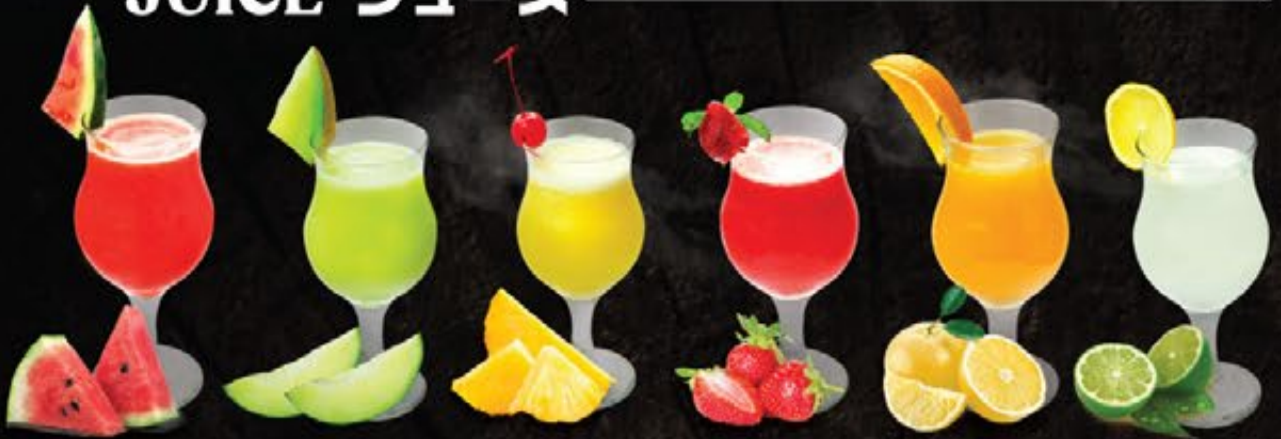
WATERMELON ウォーターメロン (すいか)