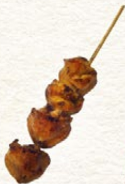
Bonjiri ボンジリ tail bone meat 20**