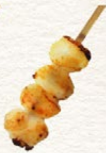
Hotate ホタテ scallop 52**