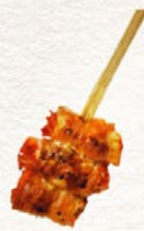
Buta Kimchi 豚キムチ pork wrapped kimchi 35**