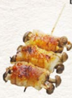
Buta Kinoko 豚キノコ pork wrapped mushroom 35**