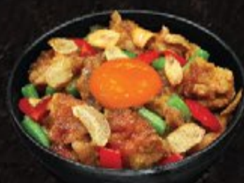
Chicken Stamina Don 110** チキンスタミナ丼

grilled chicken and garlic on top of rice