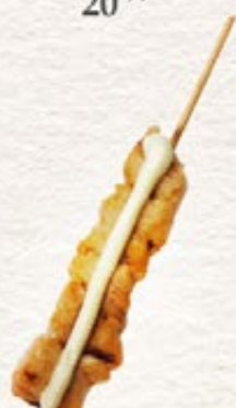
Sasami Mayo ささみ マヨネーズ chicken tenderloin mayonnaise 27**