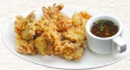
Chicken Karage 70++ チキン唐揚げ deep fried chicken with "oroshi pon-zu" sauce