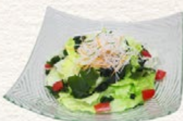
Wakame Salad 55** わかめサラダ