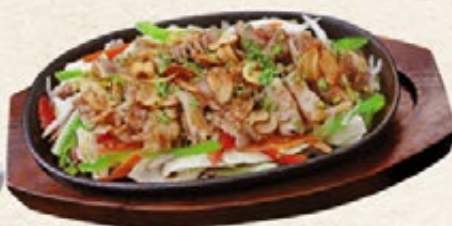
Buta Yasai Itame 90 ++ 豚野菜炒め sauteed pork with vegetables

crispy deep fried pork mille-feuille cutlet hot plate