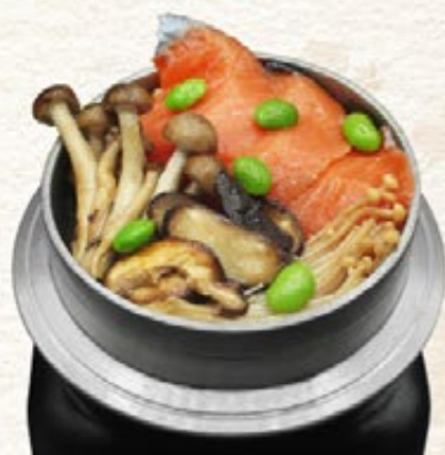
Sake Kinoko 120** 鮭キノコ salmon and mushroom