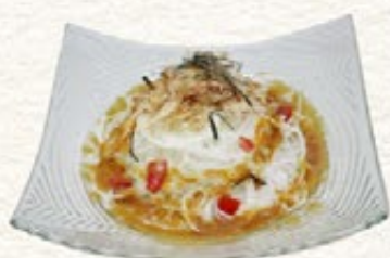
Onion Slice 46** オニオンライス