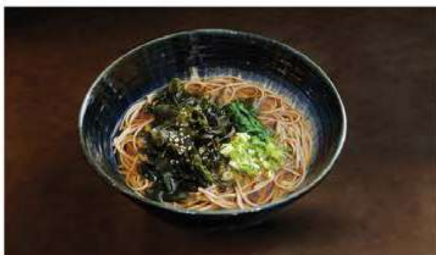
わかめ そば/うどん Wakame soba / udon 125 seaweed soba or udon