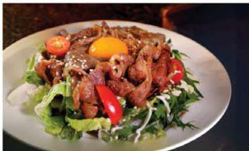
すき焼きサラダ Sukiyaki Salad 150/80 beef sukiyaki salad