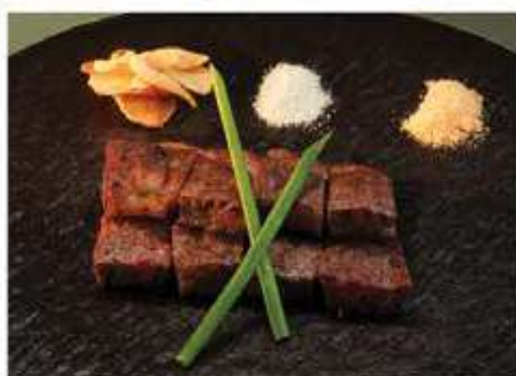
オーストラリア和牛鉄板焼き Australian Wagyu Teppanyaki iron-plate grilled Australian wagyu 590