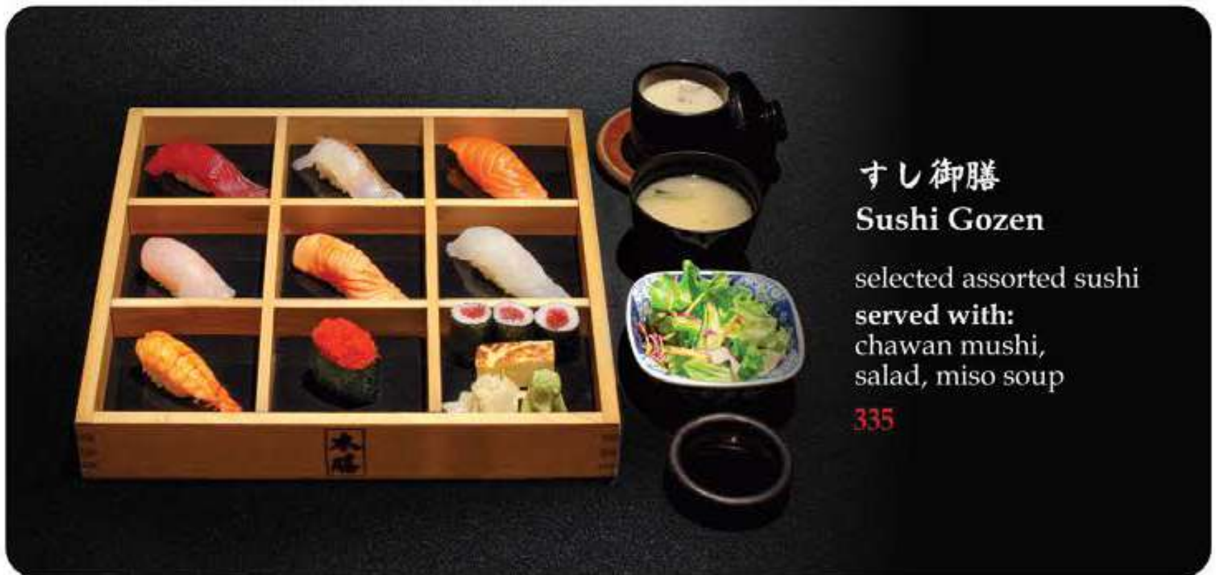
すし御膳 Sushi Gozen

*Menu will be made based on ingredients' availability