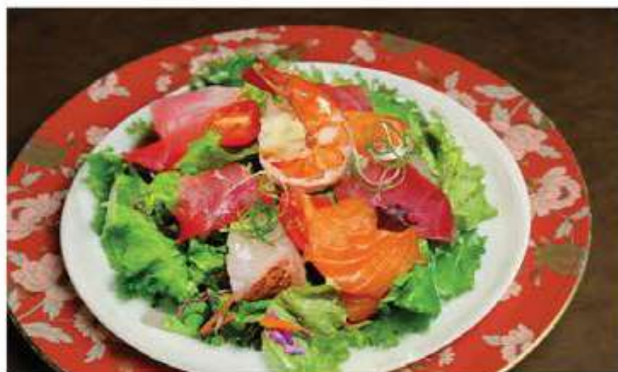
海鮮シーザーサラダ Kaisen Caesar Salad 150/80 seafood caesar salad