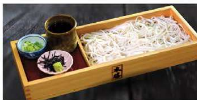
稲庭うどん 温冷 Inaniwa Udon Akita style thin udon 140