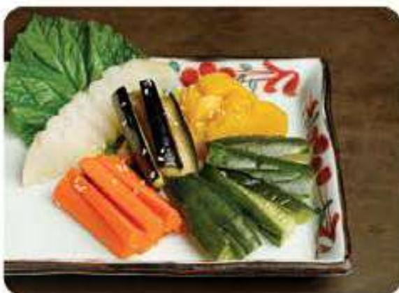
お新香盛り合わせ Oshinko Moriawase