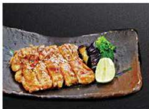
鶏の照り焼き Chicken Teriyaki grilled chicken with teriyaki sauce 145