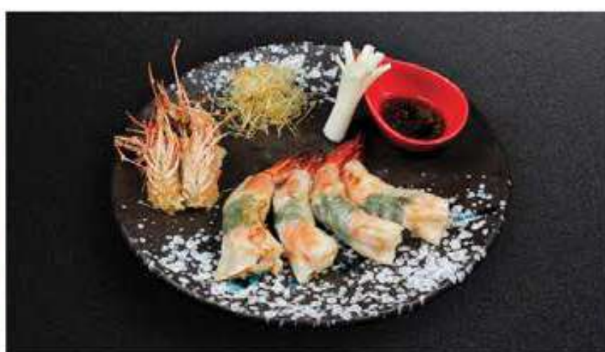
海老餃子 Ebi Gyoza 195 pan-fried dumpling filled with shrimp served with dipping sauce