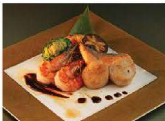
海鮮鉄板焼き Seafood Teppanyaki iron-plate grilled assorted seafood 300