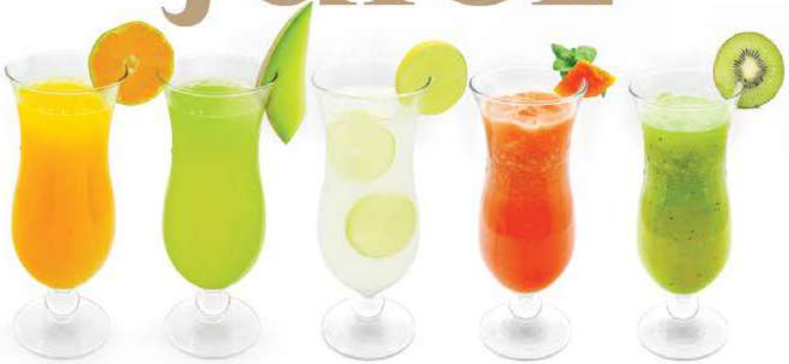
オレンジ Orange Juice 65