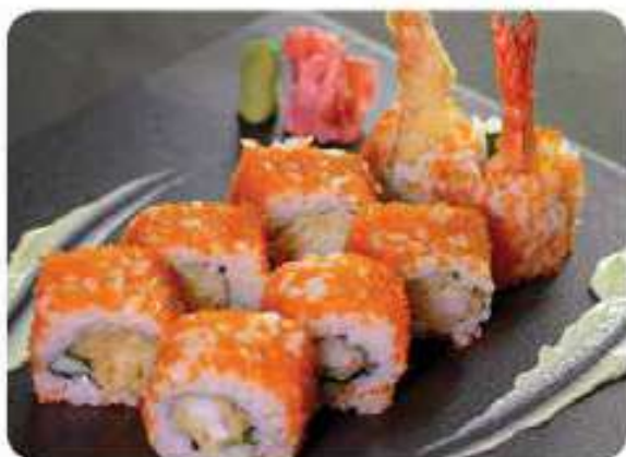
天婦羅ロール Tempura Roll