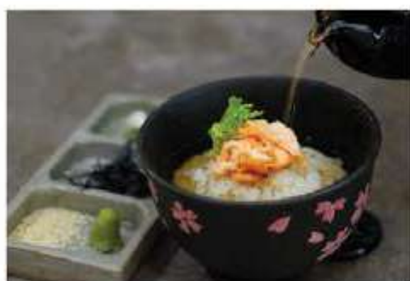
鮭茶漬 Shake Chazuke