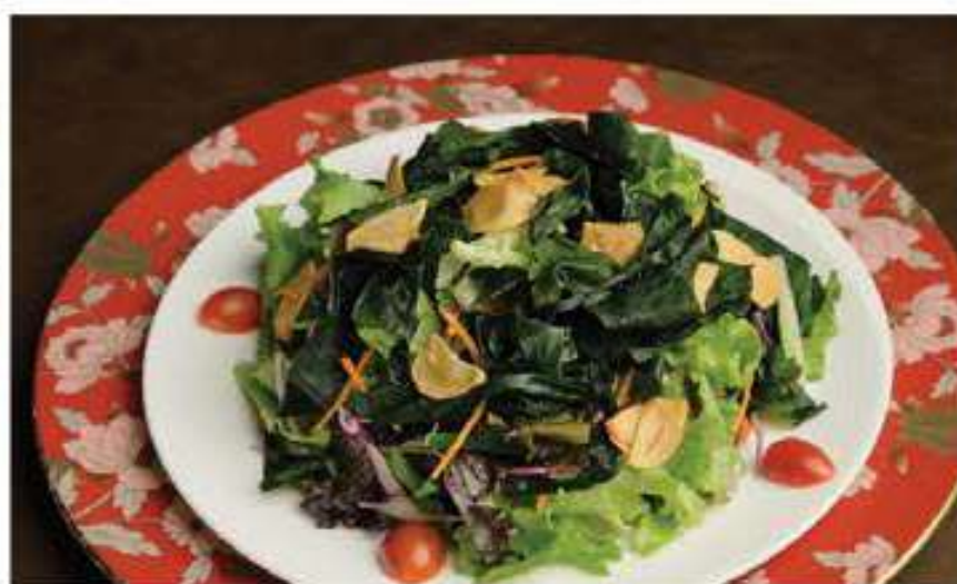
わかめサラダ Wakame Salad 100/60 seaweed salad