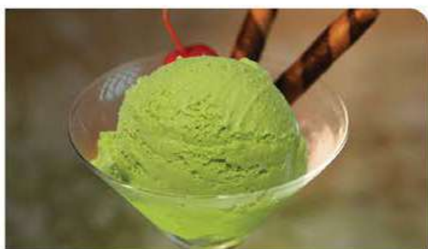
Matcha Ice Cream 抹茶アイスクリーム