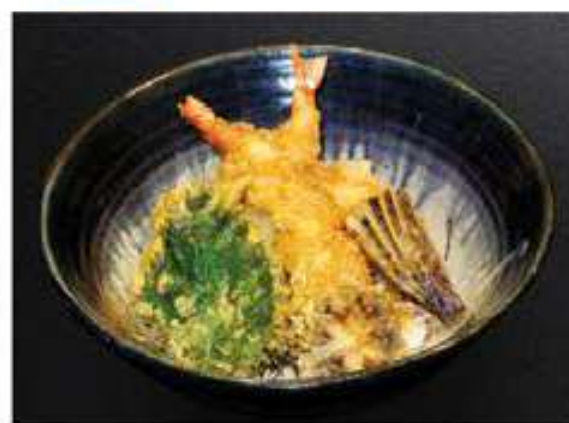
天井 Ten Don