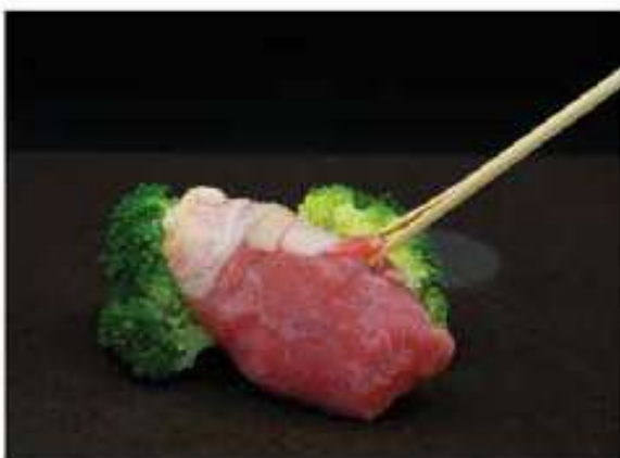
Gyurose • 牛ロース 35