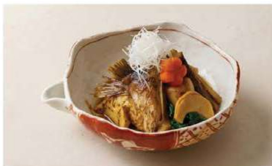
鯛兜山椒煮 Tai Kabuto sea bream helmet with Japanese pepper