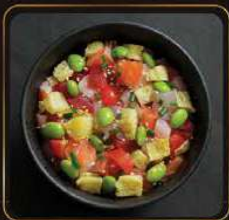
Mini Bara Chirashi ミニバラちらし cubed marinated sashimi small rice bowl