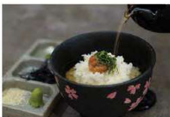
梅茶漬 Ume Chazuke