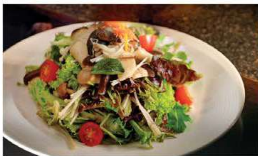
キノコサラダ Kinoko Salad 100/60 mushroom salad