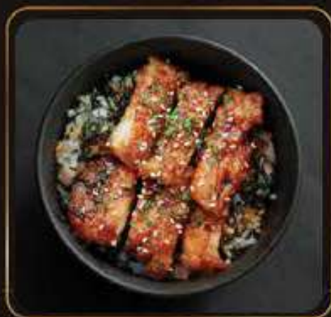
Mini Teriyaki Don ミニ照り焼き丼 chicken teriyaki small rice bowl