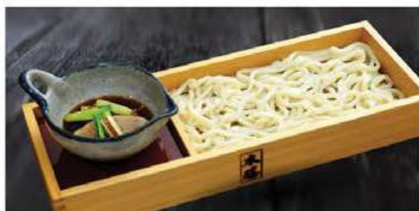
鴨汁そばうどん Kamojiru Soba / Udon duck soup soba or udon 130