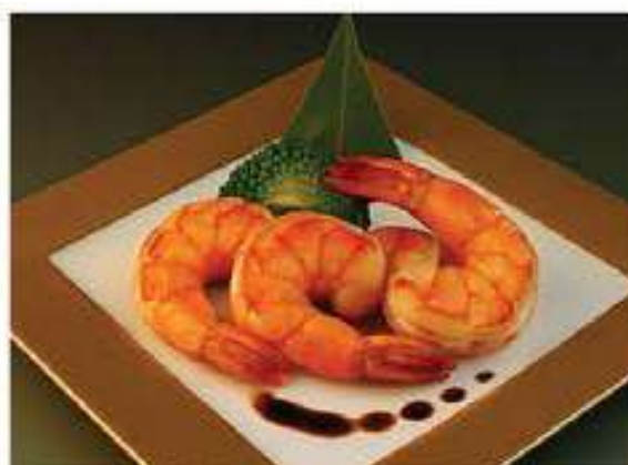
エビ鉄板焼き Ebi Teppanyaki iron-plate grilled ebi 280