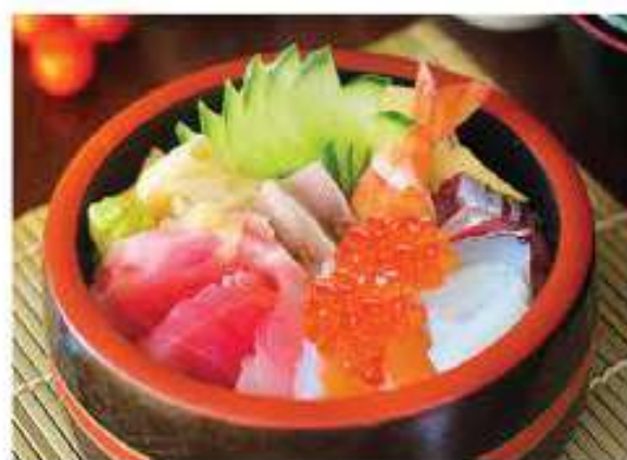
海鮮丼 Kaisen Don 400

*Menu will be made based on ingredients' availability