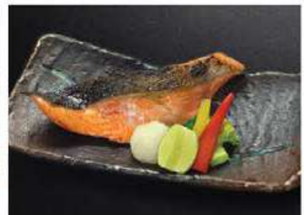
サーモン西京焼き Salmon Saikyoyaki grilled salmon marinated with miso 175