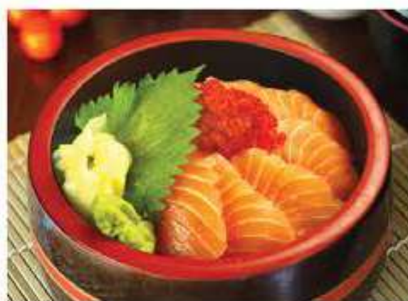
サーモンちらし Salmon Chirashi 370

bowl of rice topped with tuna, salmon and avocado