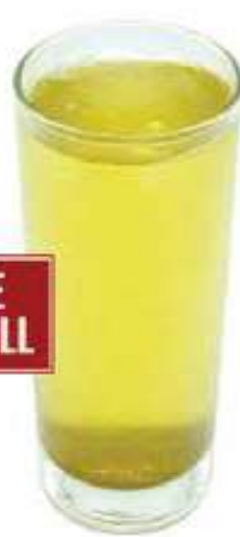
お茶 グリーンティー Iced/Hot Ocha (Green Tea) 25