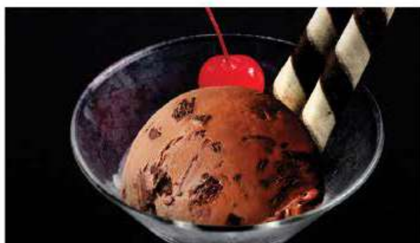
Chocolate Ice Cream チョコレートアイスクリーム