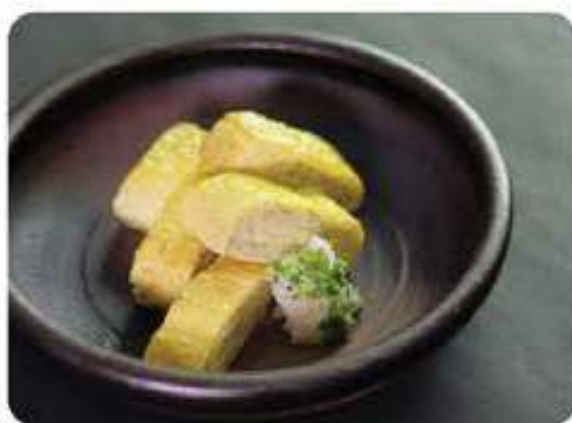
出汁巻き玉子 Dashimaki Tamago

Japanese rolled omelette with rice cake fillings