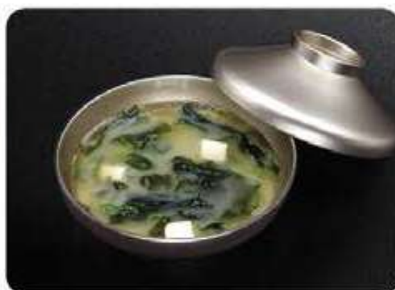
味噌汁 35 Miso Soup