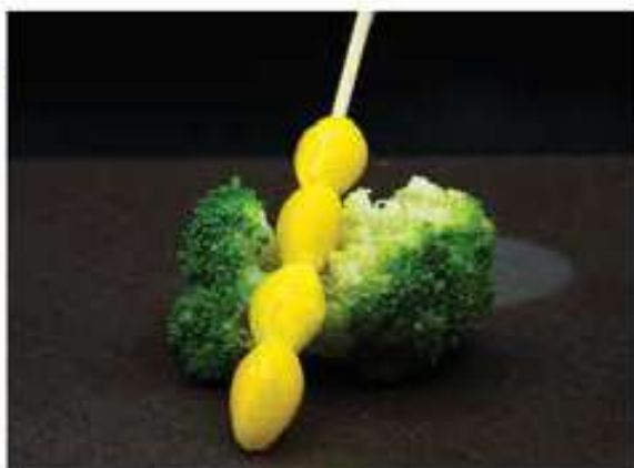
Ginnan • 銀杏 25