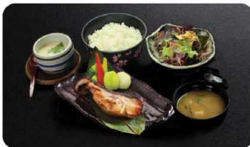
銀だら西京焼き Gindara Saikyoyaki SET

grilled silver cod marinated with miso served with rice, chawan mushi, salad, miso soup