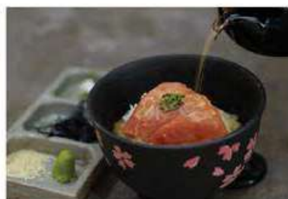
鮪茶漬 Maguro Chazuke