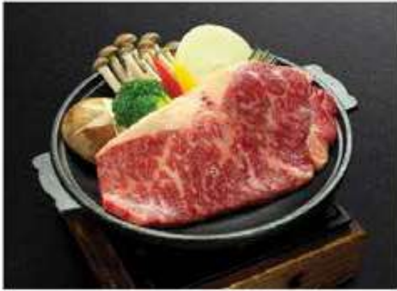
オーストラリア和牛 キノコ添え Wagyu Kinoko Soe 120gram sauteed Australian wagyu served with assorted mushroom 580