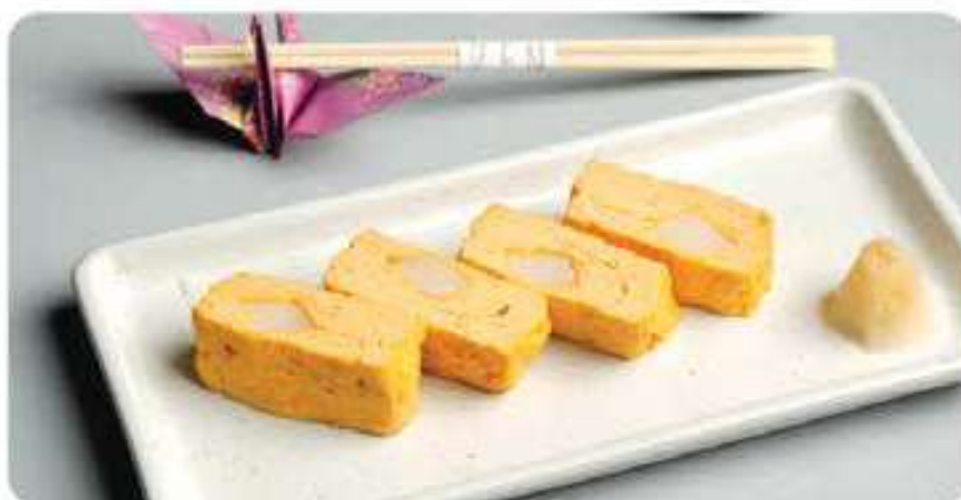
だし巻き餅玉子 Dashimaki Mochi Tamago