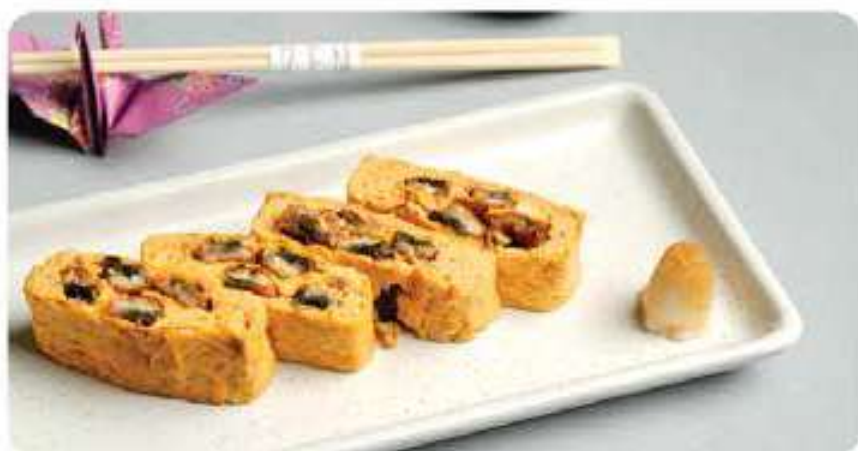
うな玉子焼き Una Tamago Yaki