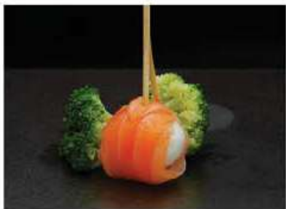
• Salmon Uzura Tamago 35 • サーモン鞠玉子