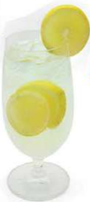
Lemon Squash レモン スカッシュ 65