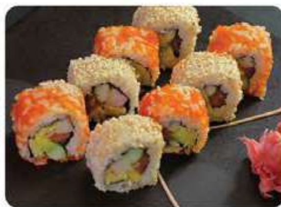
カリフォルニアロール California Roll