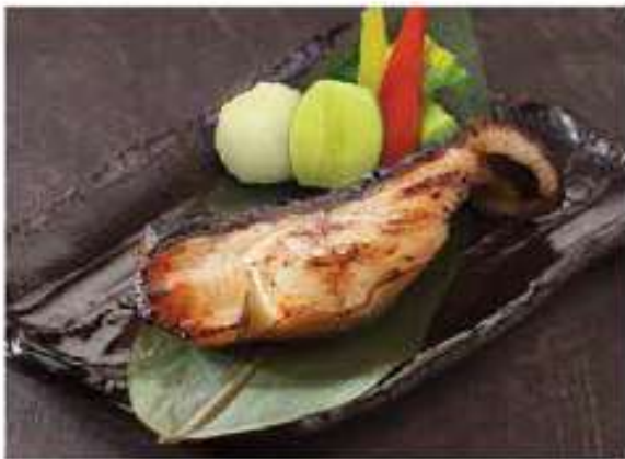
銀だら焼き <塩・照り焼き> Gindara Yaki grilled silver cod with salt / teriyaki sauce 370