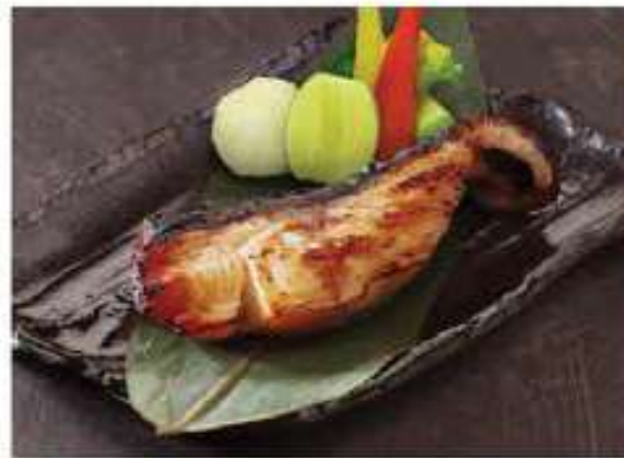
銀だら西京焼き Gindara Saikyoyaki grilled silver cod marinated with miso 380