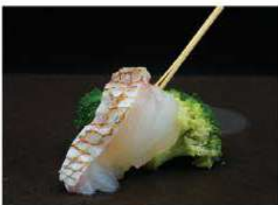
Sakana • 魚 30