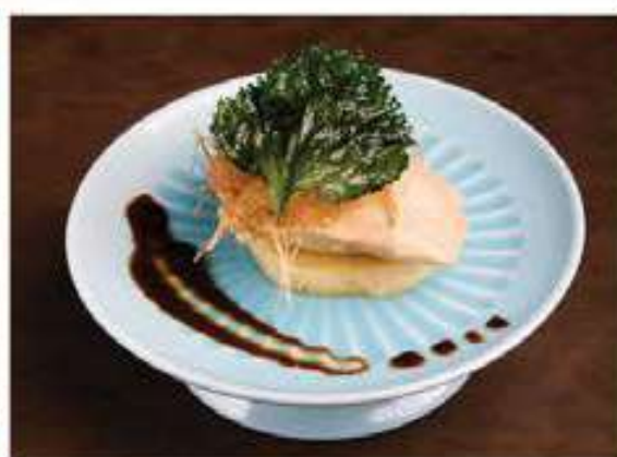
フォアグラ Foie Gras Teppanyaki iron-plate grilled foie gras 420