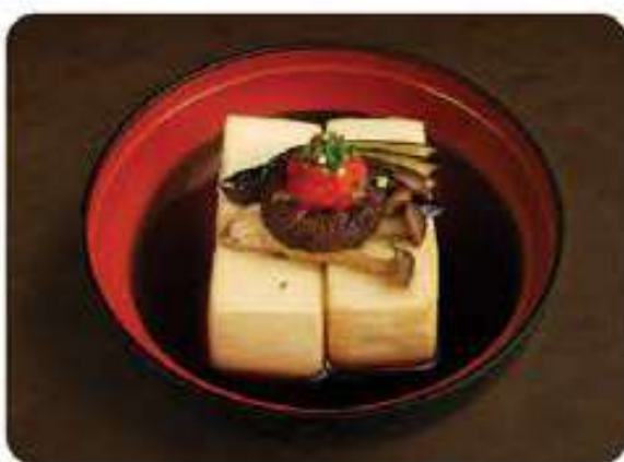
揚げ出し豆腐 Agedashi Tofu (4 pcs)