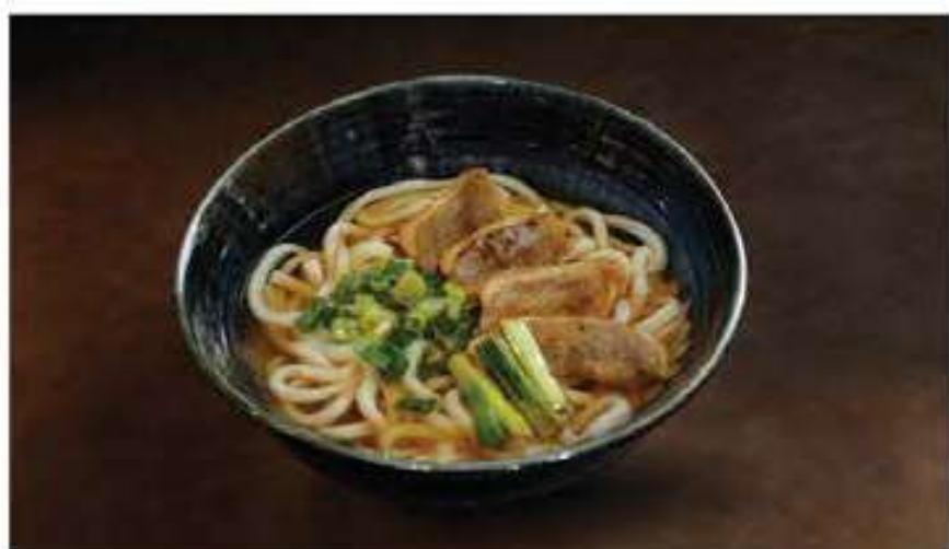
鴨南蛮そばうどん Kamo Nanban Soba / Udon 150 duck soba or udon