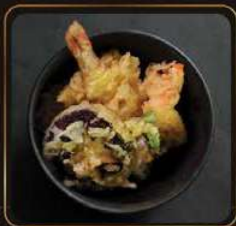
Mini Ten Don ミニ天丼 tempura small rice bowl