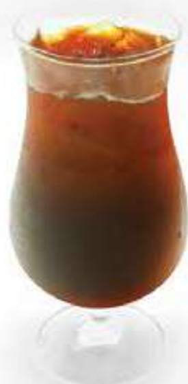
ウーロン ティー Oolong Tea 48