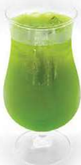
抹茶 グリーンティー Matcha (Green Tea) 60