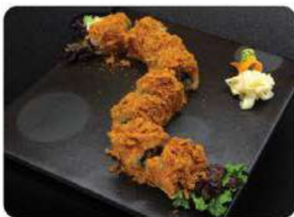
ドラゴンロール Dragon Roll