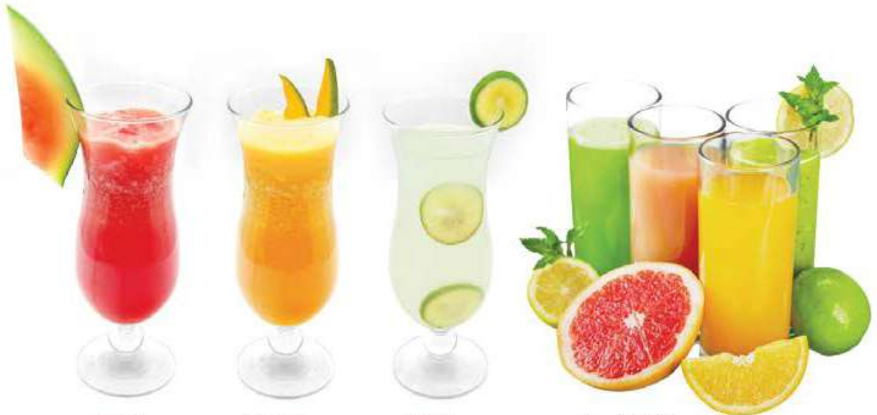
スイカ Watermelon Juice 65