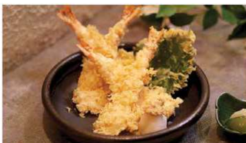
海老天婦羅 Ebi Tempura 180 king prawn tempura