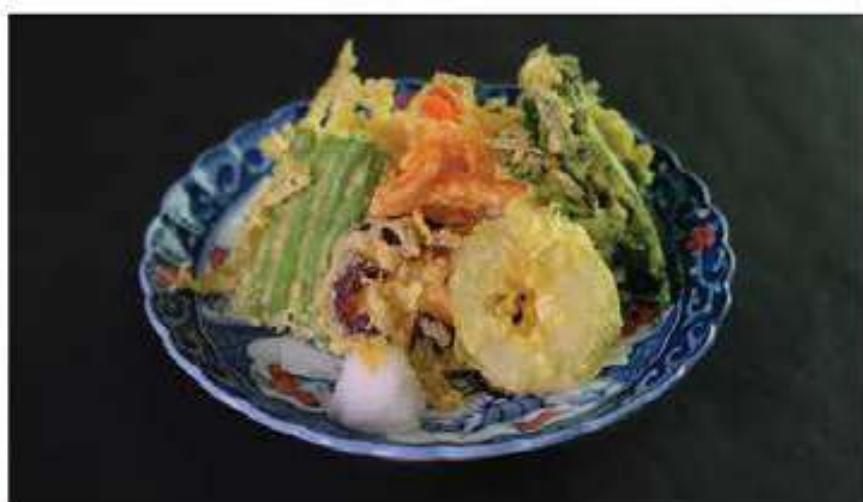
野菜天婦羅盛り合わせ Yasai Tempura Moriawase 100 assorted vegetables tempura