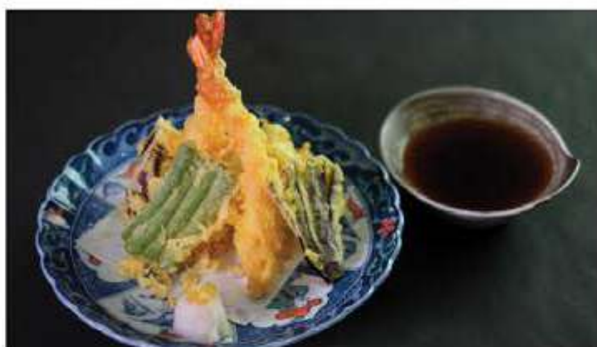
天婦羅盛り合わせ Tempura Moriawase 150 assorted tempura