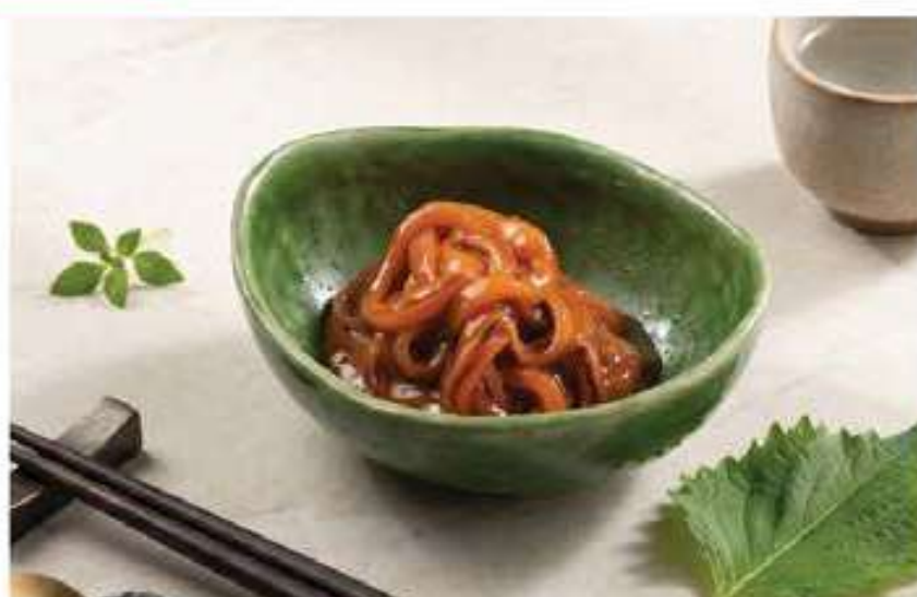
いか塩辛 Ika Shiokara salted and lightly fermented squid