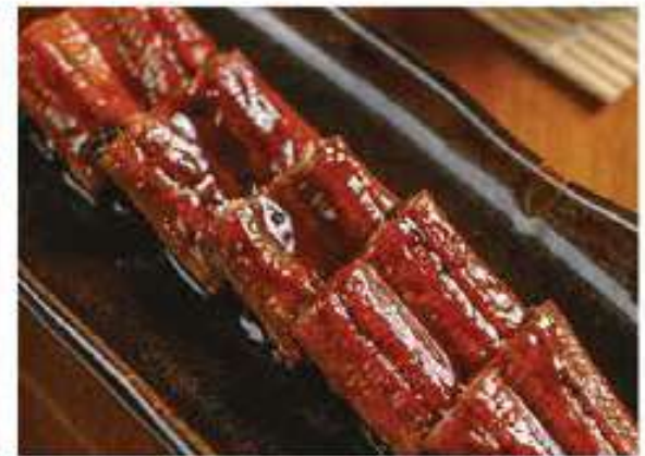
うなぎ蒲焼 Unagi Kabayaki grilled eel with sweet sauce 400