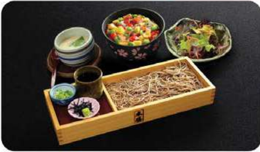
ざるそばうどん Zaru Soba / Udon