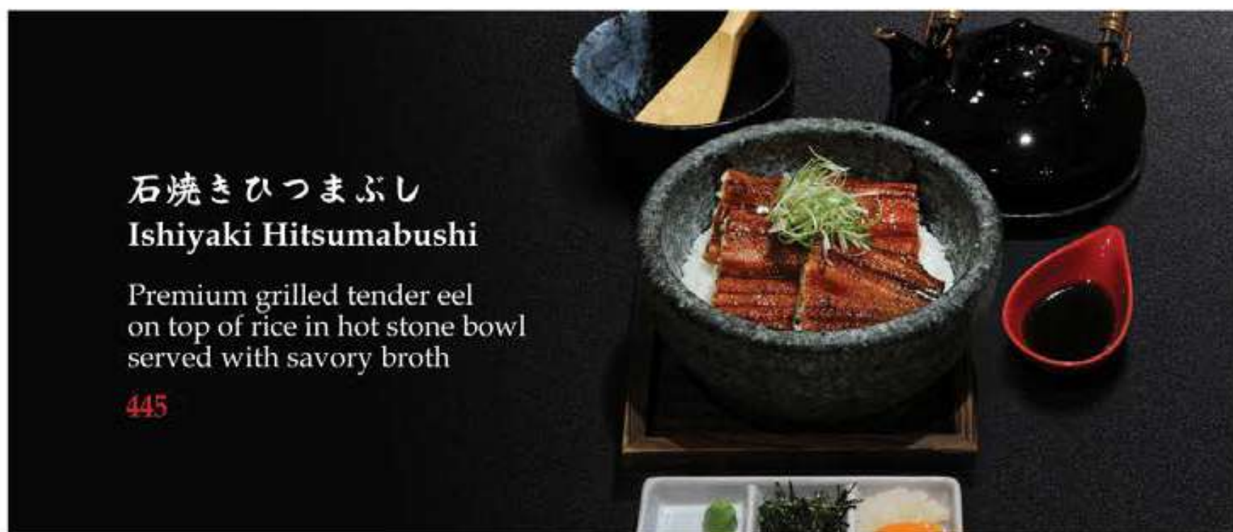
石焼きひつまぶし Ishiyaki Hitsumabushi

Premium grilled tender eel on top of rice in hot stone bowl served with savory broth