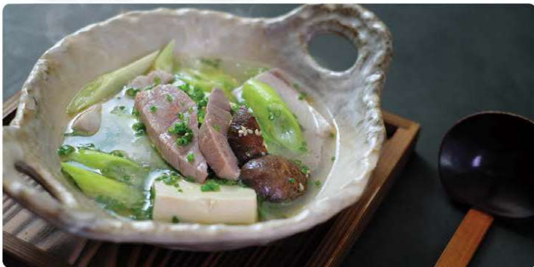
鯖のねぎまスープ Maguro no Negima Soup tuna and Welsh onion soup