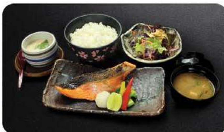
サーモン西京焼き Salmon Saikyoyaki SET

grilled salmon marinated with miso served with: rice, chawan mushi, salad, miso soup