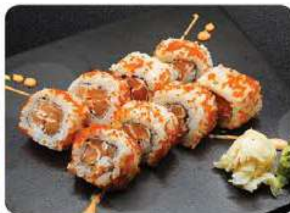
サーモンロール Salmon Roll