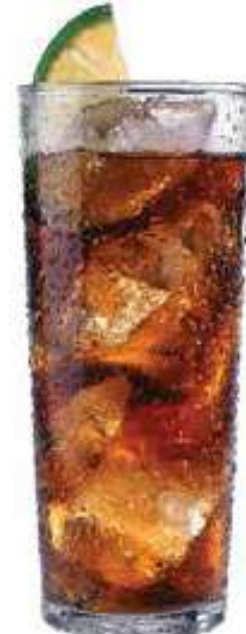
Coke Highball コークハイ