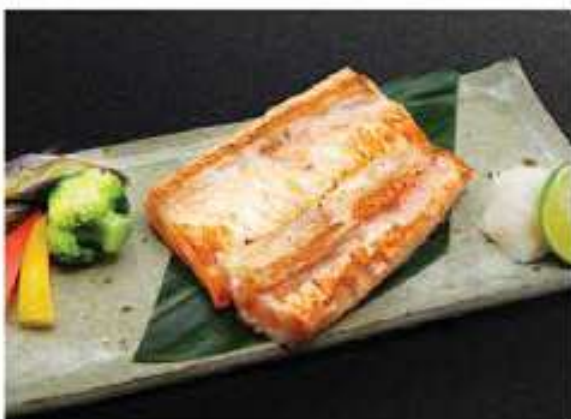
サーモンハラス炭火焼き Salmon Harashu Yaki grilled salmon belly 235