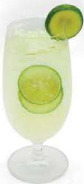
Lime Squash ライムスカッシュ 65