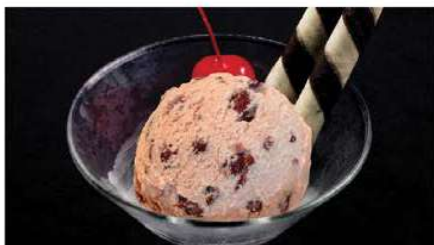
Ogura Ice Cream 小倉アイスクリーム