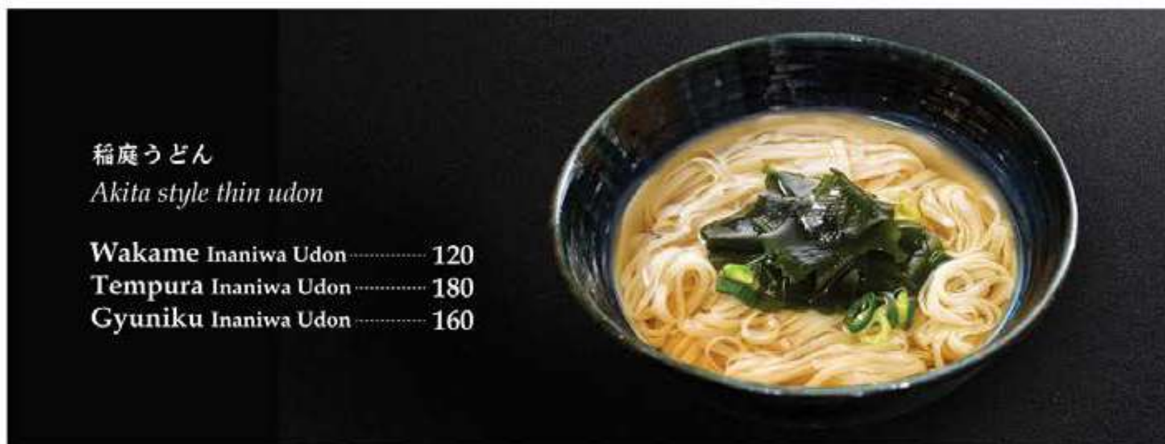
稲庭うどん Akita style thin udon