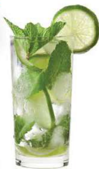
Virgin Mojito バージンモヒート 90