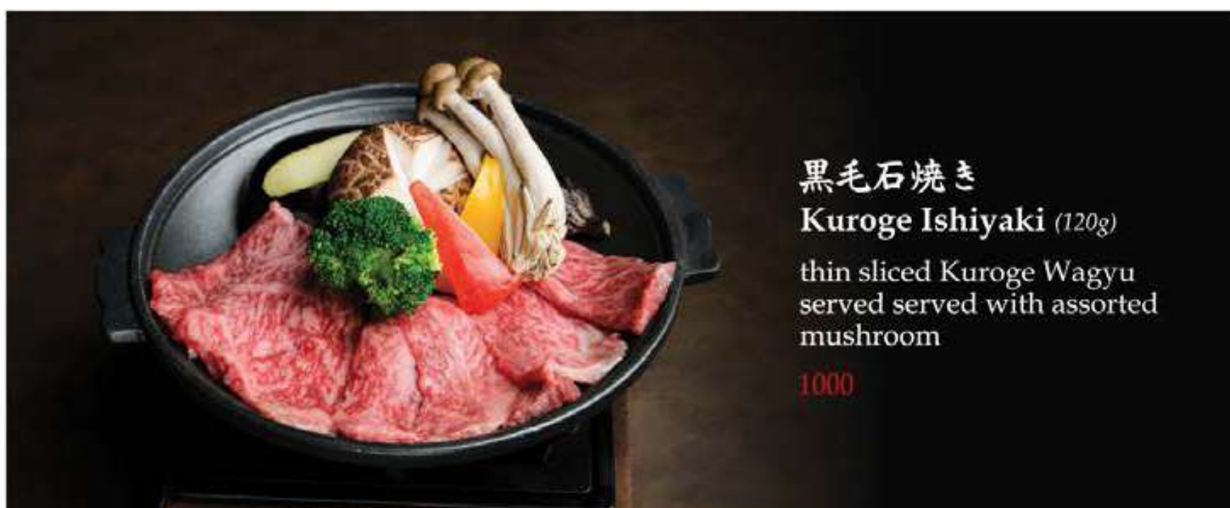
黒毛石焼き Kuroge Ishiyaki (120g) thin sliced Kuroge Wagyu served served with assorted mushroom