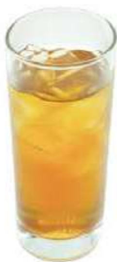
ティー Iced/Hot Tea 40