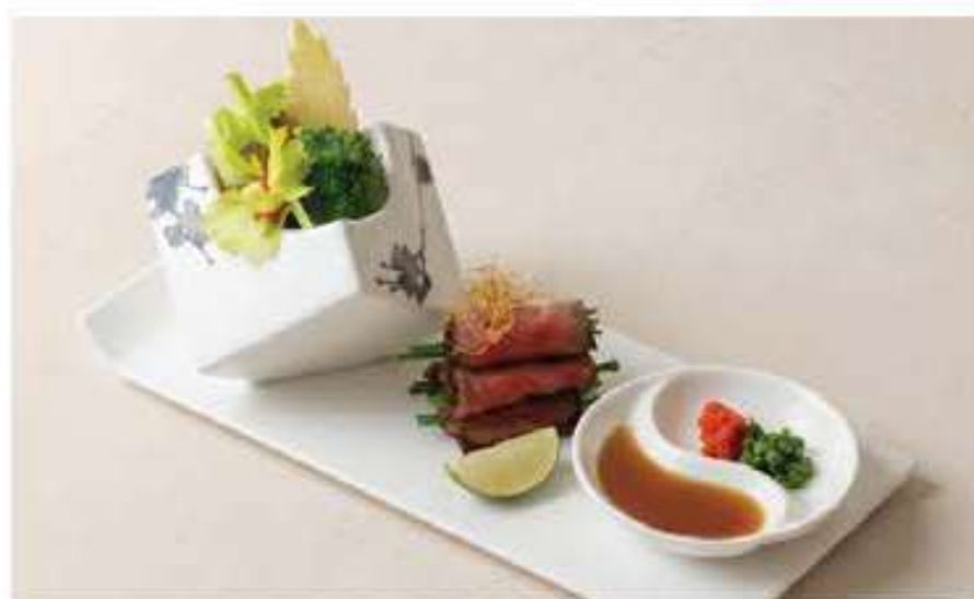
牛タタキ Gyu Tataki beef tataki