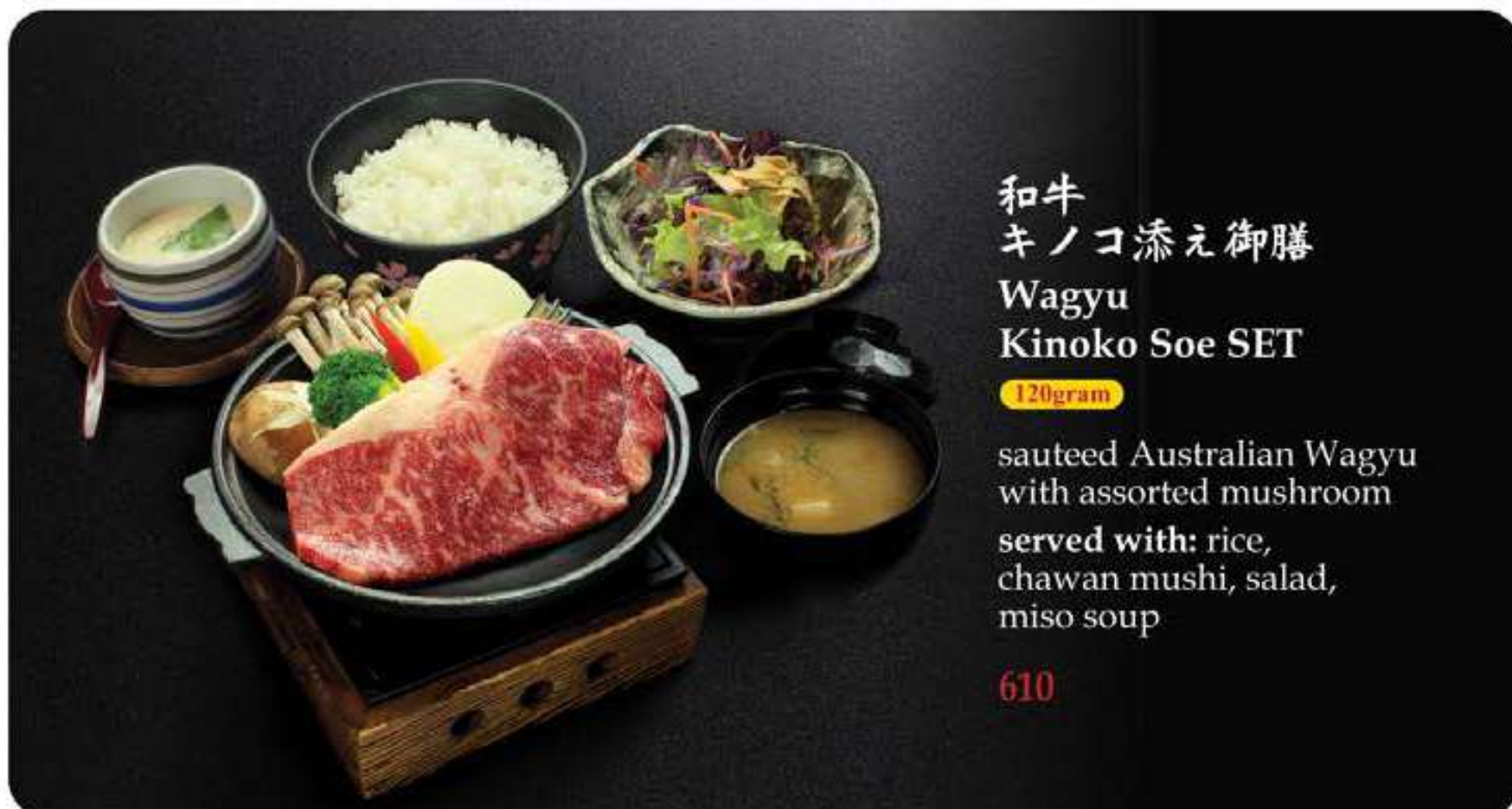
和牛 キノコ添え御膳 Wagyu Kinoko Soe SET