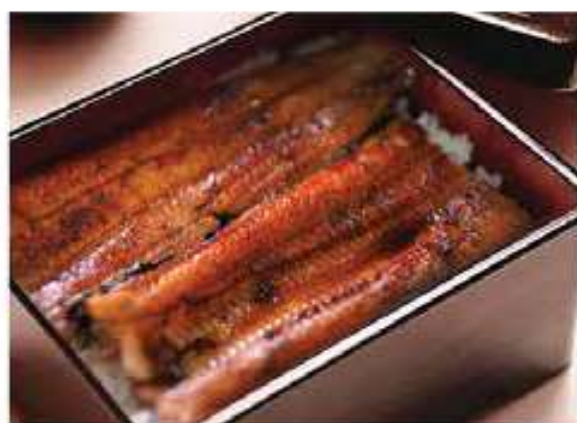
うな重 Una Jyu

premium grilled tender eel on top of rice