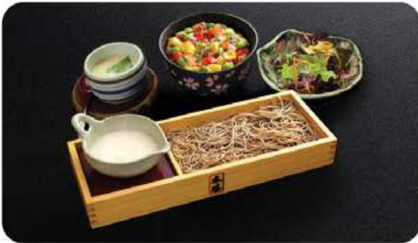
とろろそばうどん Tororo Soba / Udon