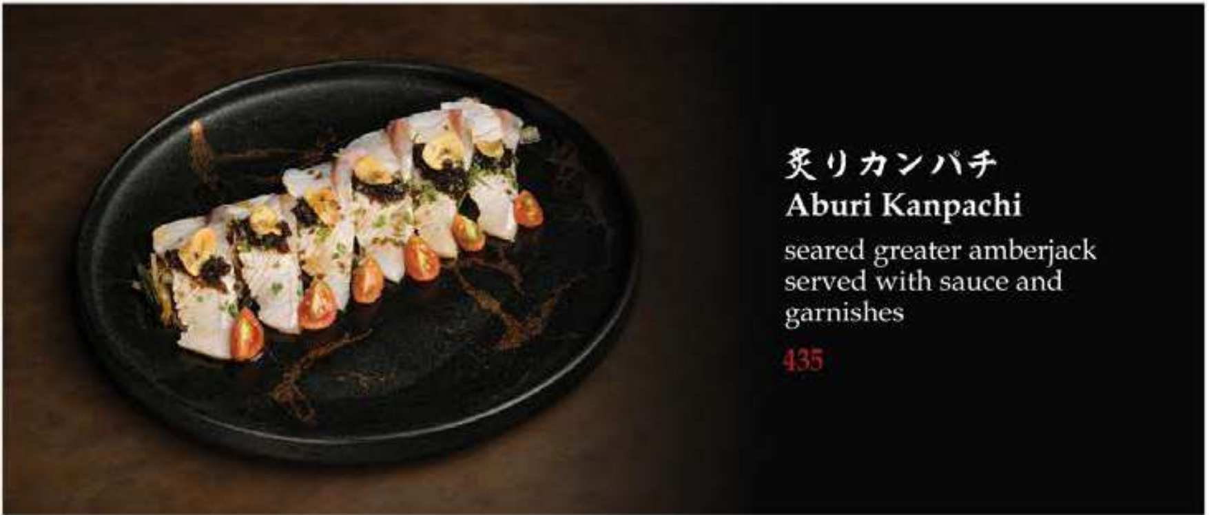
炙りカンパチ Aburi Kanpachi

seared greater amberjack served with sauce and garnishes