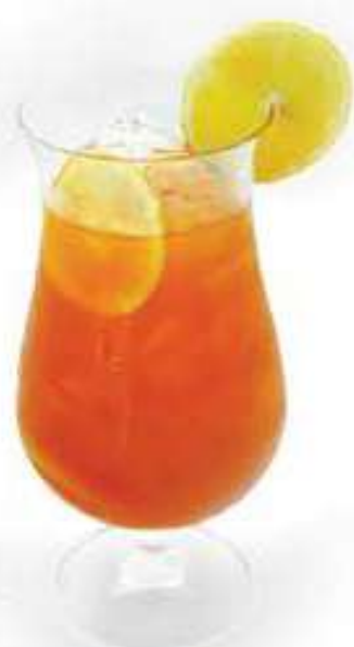
レモンティー Lemon Tea 48