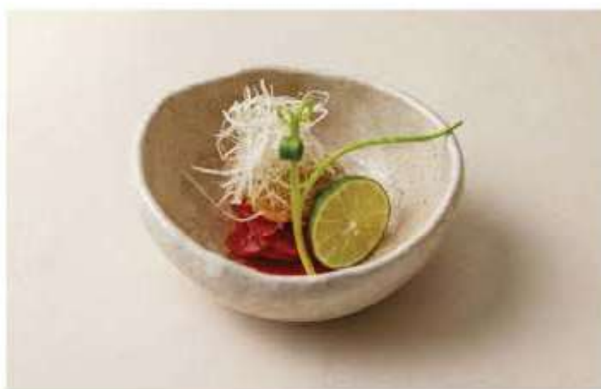
マグロ酢味噌がけ Maguro Sumiso tuna with vinegar miso