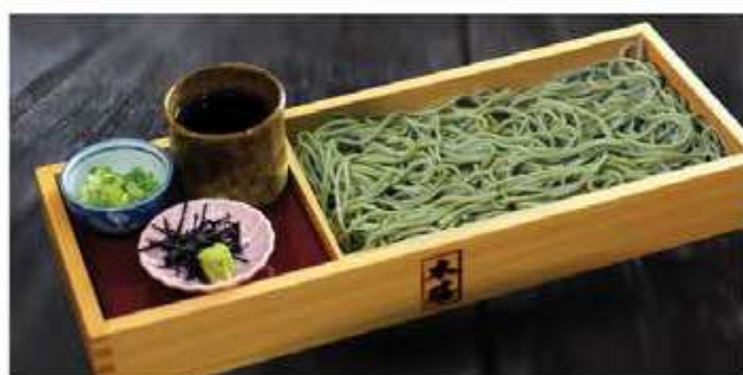
茶そば Chasoba green tea soba 130