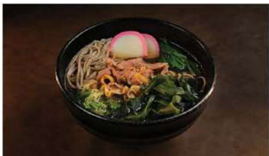
牛肉 そば/うどん Gyuniku Soba / udon 150 beef soba or udon