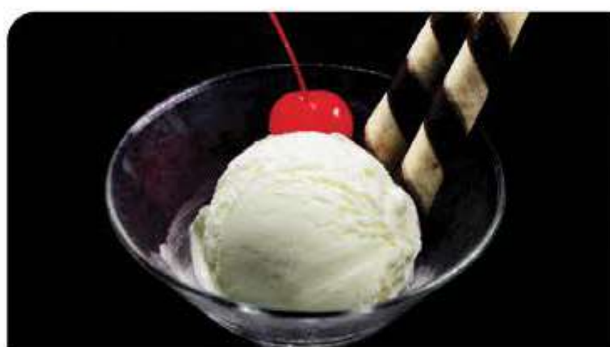
Vanilla Ice Cream バニラアイスクリーム