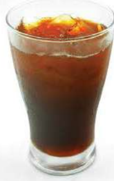
Rich Oolong Tea High 煮だしウーロンハイ 135