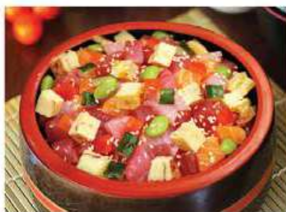
バラちらし Bara Chirashi 305

bowl of rice topped with tuna, salmon and avocado