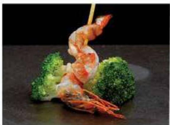
Ebi • 海老 30