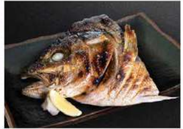
ハマチ・かんぱち兜焼き Hamachi / Kanpachi Kabuto Yaki grilled amberjack head with with ponzu 450