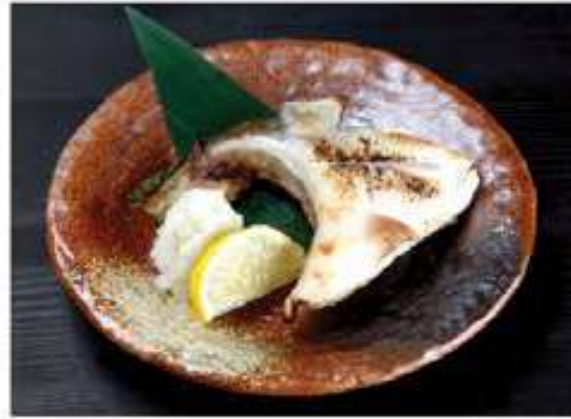
はまちカマ炭火焼 Hamachi Kama Sumibiyaki grilled amberjack sickle with ponzu 330