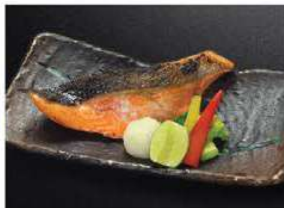
サーモン焼き <塩・照り焼き> Salmon Yaki grilled salmon with salt /teriyaki sauce 165