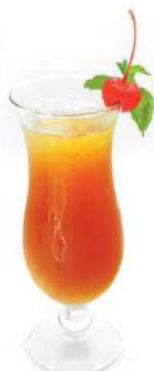
レイシティー Lychee Tea 65