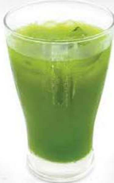
Rich Green Tea High 濃厚緑茶ハイ 130