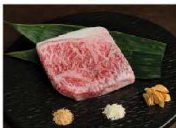
黒毛和牛鉄板焼き Kuroge Wagyu Teppanyaki iron-plate grilled black-haired Japanese wagyu 925