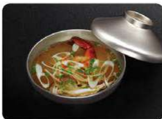
吸い物 Suimono 50 Japanese clear soup