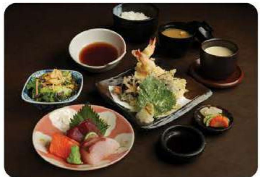
天刺御膳 Ten Sashi Gozen

assorted tempura and sashimi served with rice, chawan mushi, salad, miso soup