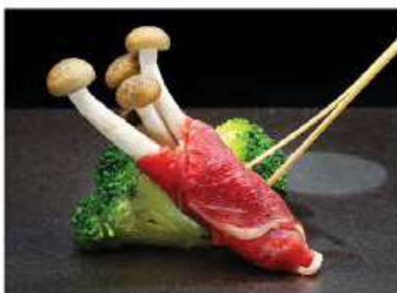
Gyu Kinoko • 牛きのこ 32