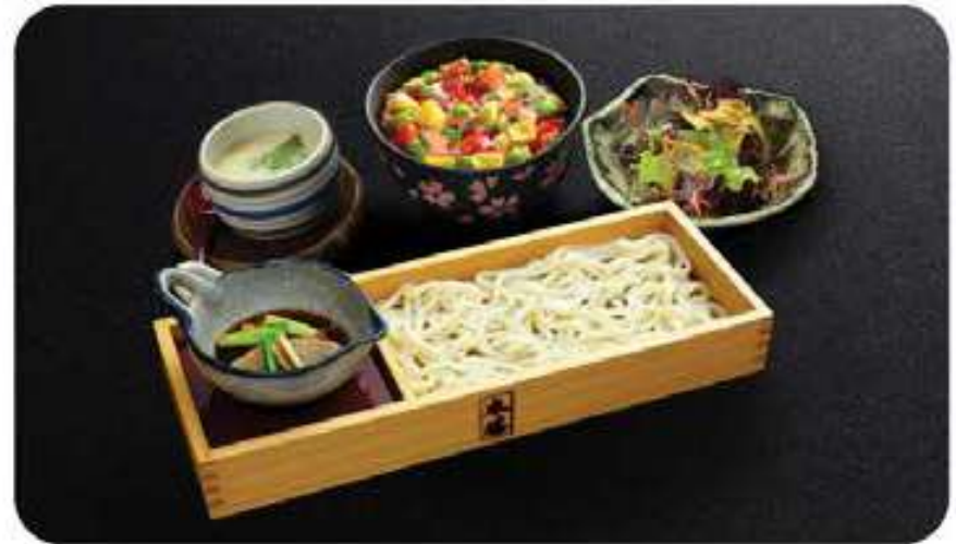
鴨汁そばうどん Kamojiru Soba / Udon