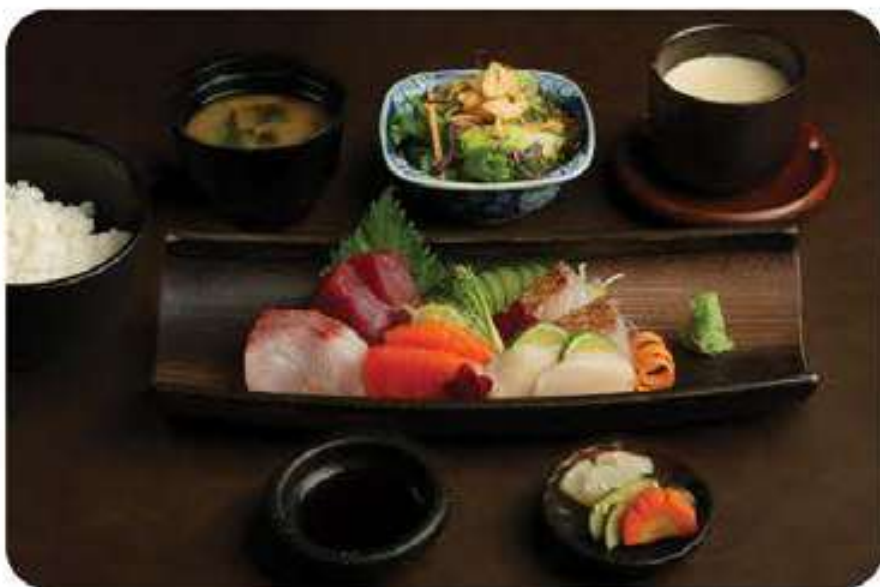
刺身御膳 Sashimi Gozen

assorted sashimi served with rice, chawan mushi, salad, miso soup