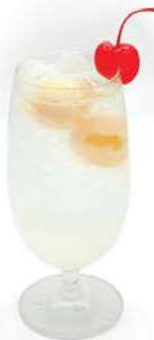
Lychee Squash レイシスカッシュ 65