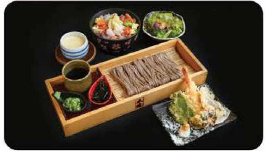
つけ天そばうどん Tsuketen Soba / Udon

(cold) tempura soba/udon with dipping soup