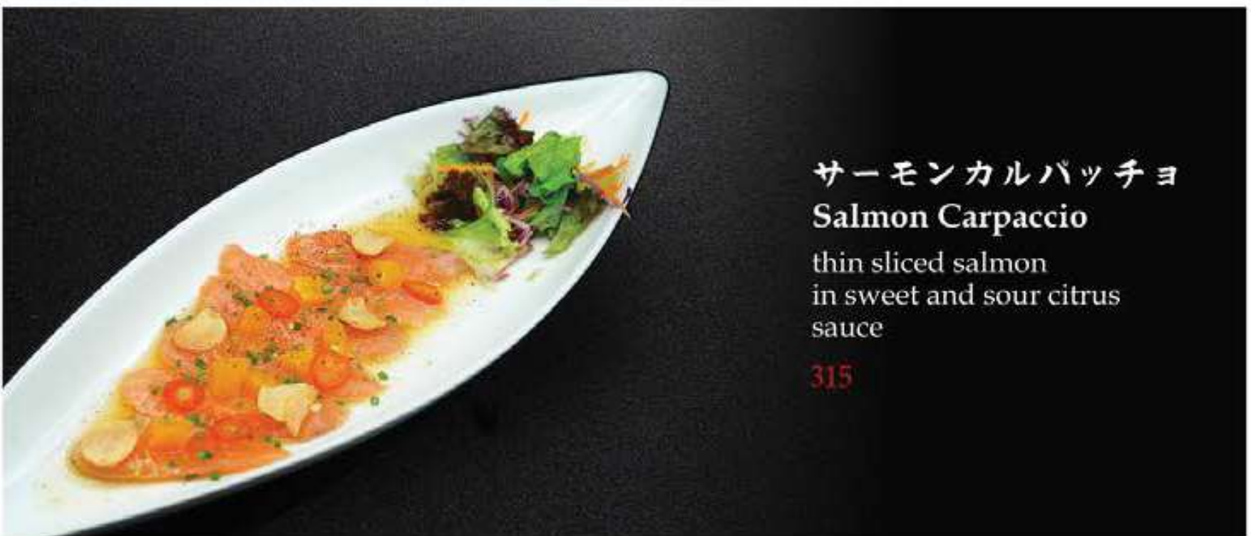
サーモンカルパッチョ Salmon Carpaccio

thin sliced salmon in sweet and sour citrus sauce