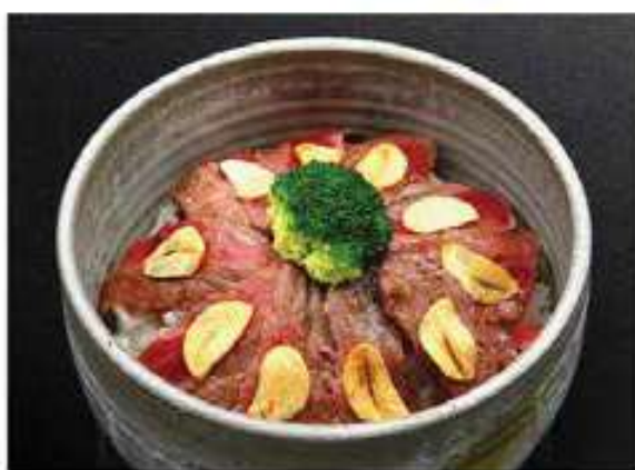
和牛丼 Wagyu Don

beef with egg served on top of rice bowl