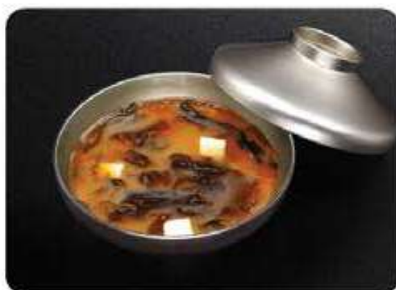
赤出汁 Akadashi 55 Akadashi soybean soup