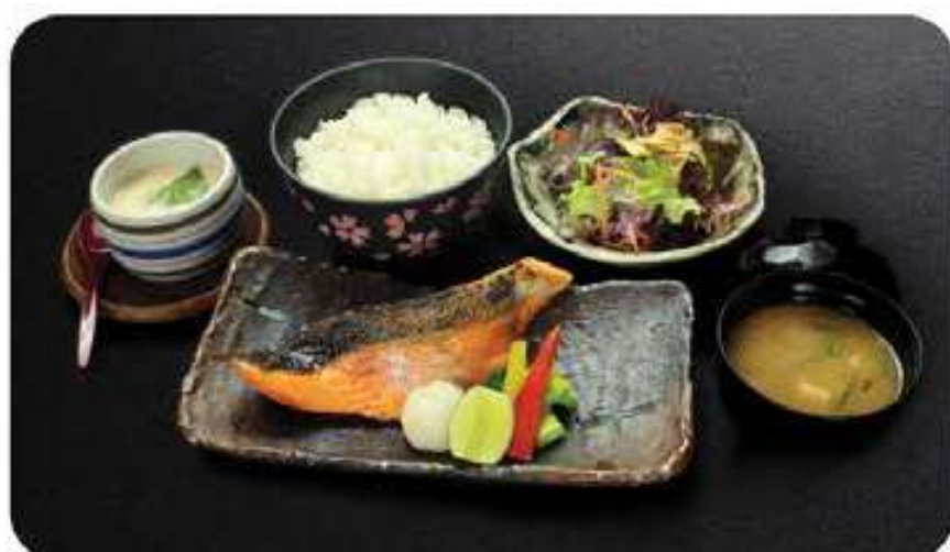
サーモン膳 Salmon SET

grilled salmon with teriyaki sauce or salt served with: rice, chawan mushi, salad, miso soup