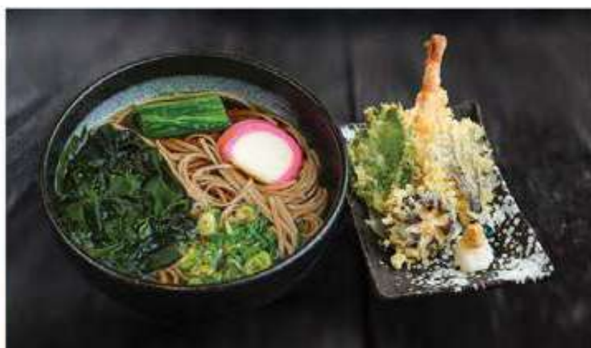
天婦羅 そば/うどん Tempura soba / udon 150 assorted tempura soba or udon