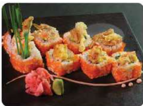
ソフトシェルクラブロール Soft Shell Crab Roll