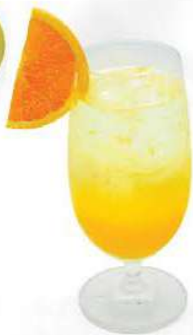
Orange Squash オレンジスカッシュ 65