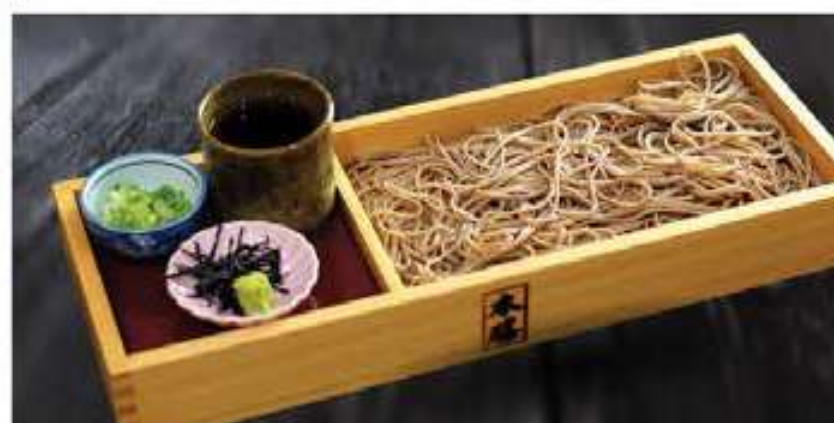
ざるそばうどん Zaru Soba / Udon (cold) soba/udon 110