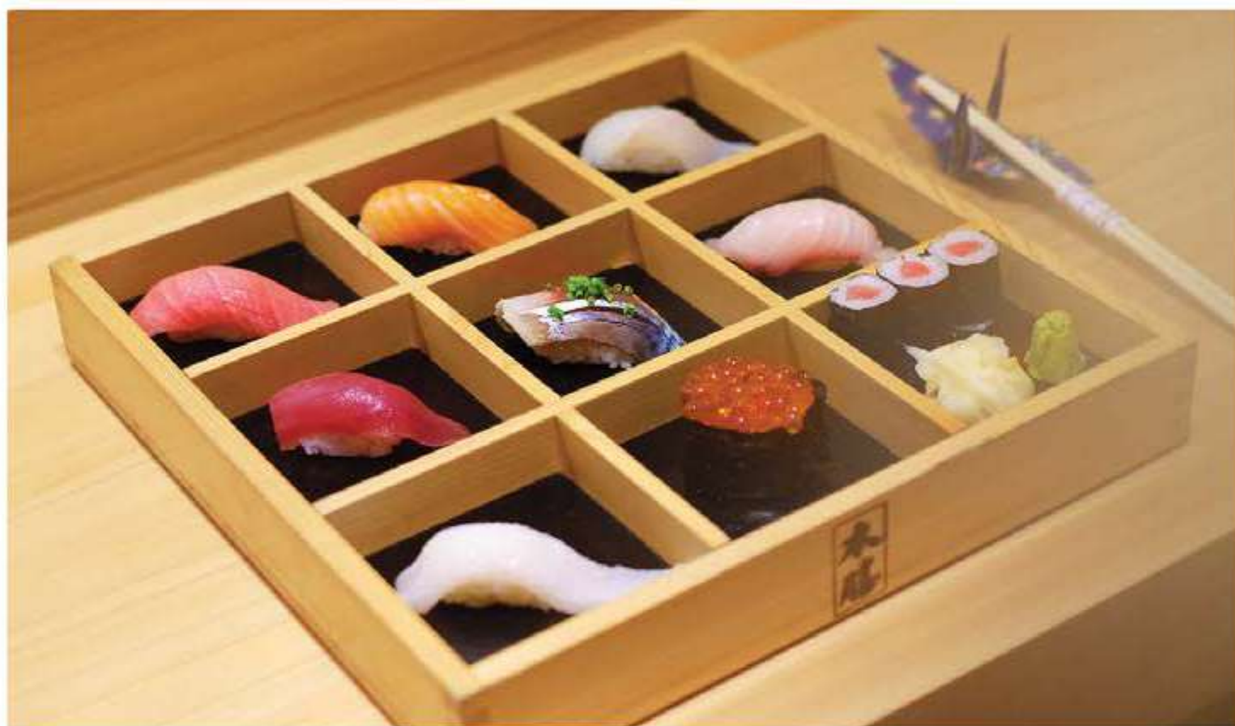
おまかせ握り Omakase Nigiri