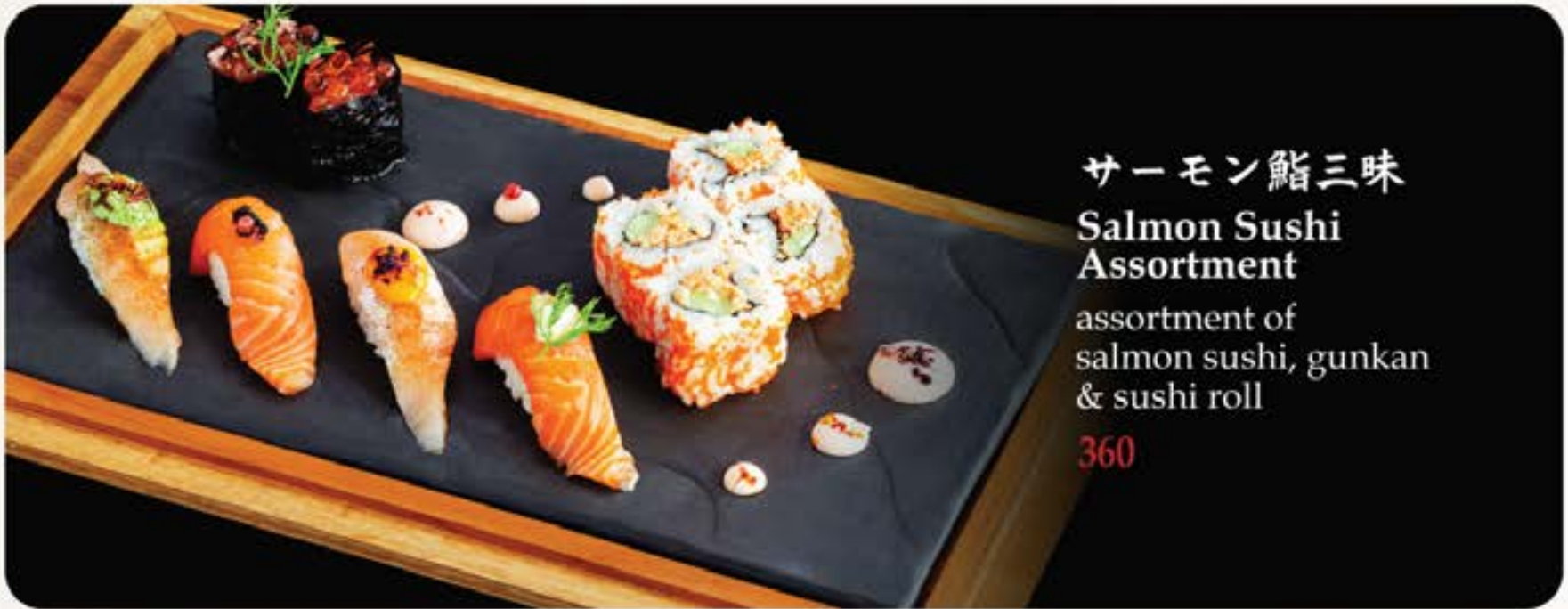
サーモン鮭三味 Salmon Sushi Assortment assortment of salmon sushi, gunkan & sushi roll 360