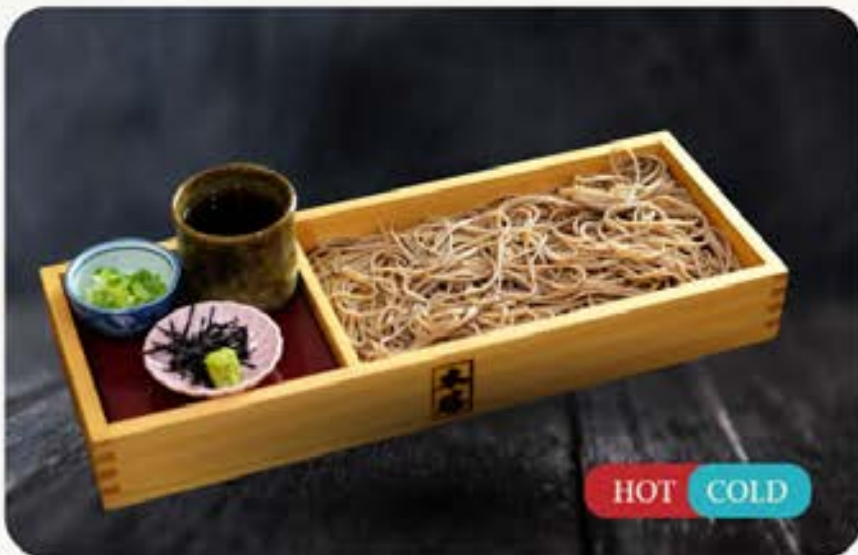
そば/うどん Soba / Udon 144