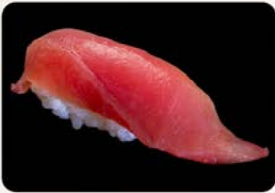
まぐろ Tuna 60