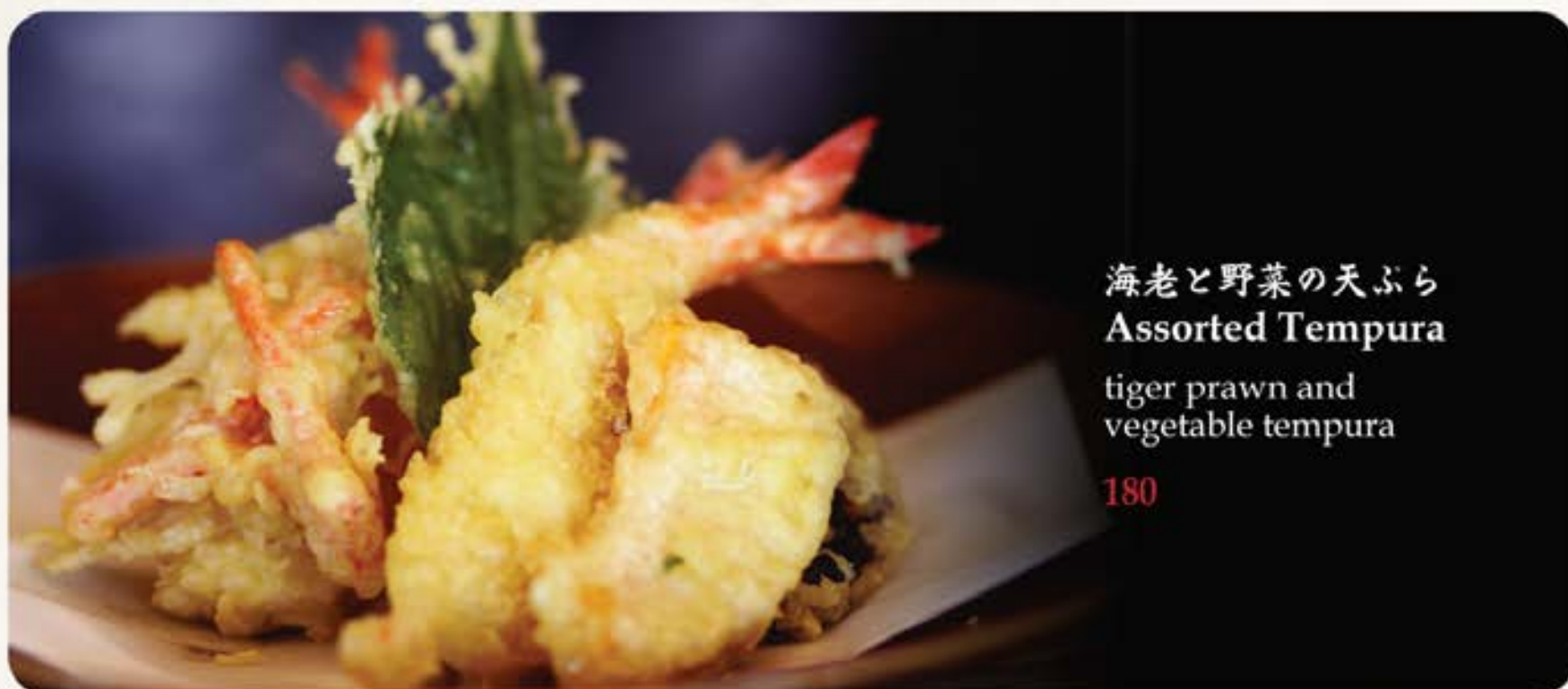
海老と野菜の天ぷら Assorted Tempura tiger prawn and vegetable tempura