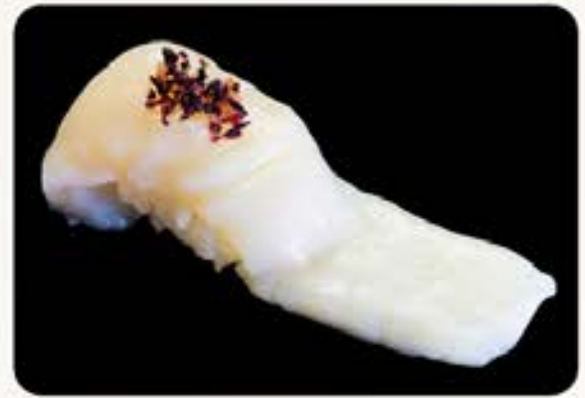
帆立 Scallop 96