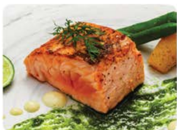
サーモン Grilled Salmon Choice: salt / teriyaki / garlic / butter soy sauce 240