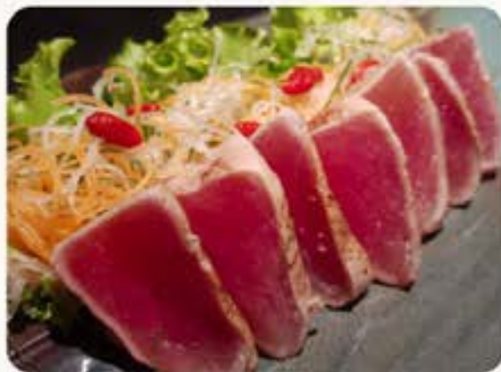
炙りマグロのたたき Tuna Tataki seared tuna slice marinated with sesame soy oil