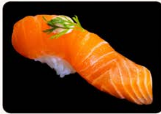
サーモン Salmon 60