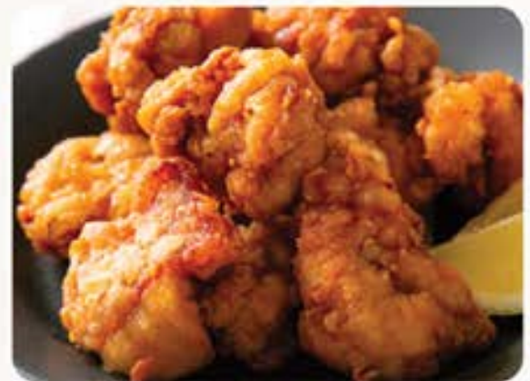
チキン唐揚げ Chicken Karaage Japanese deep fried chicken