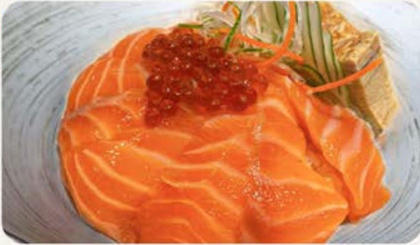
サーモン丼 Salmon Don sliced salmon on top of rice 270