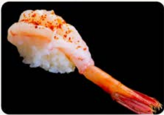
甘エビ Sweet Shrimp 132