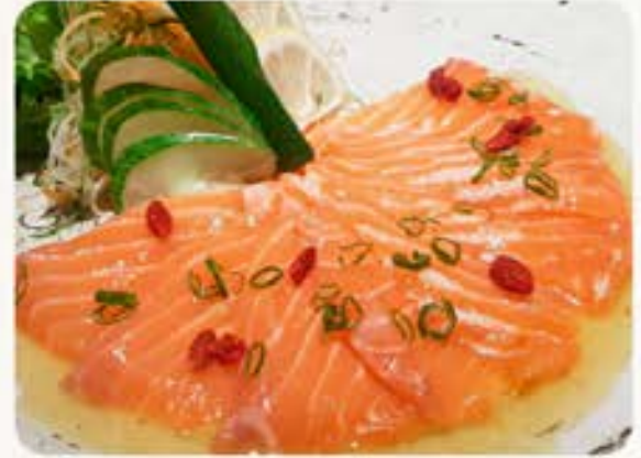
サーモンカルパッチョ Salmon Carpaccio thin sliced salmon in sweet and sour citrus sauce