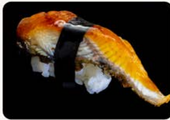
うなぎ Unagi 84