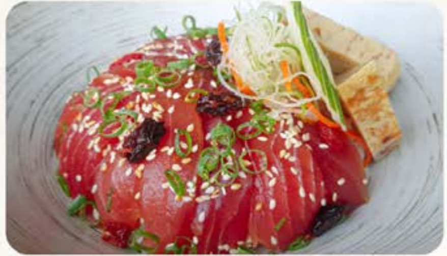
ツナ漬け丼 Tuna Zuke Don marinated thin sliced fresh tuna on top of rice 252