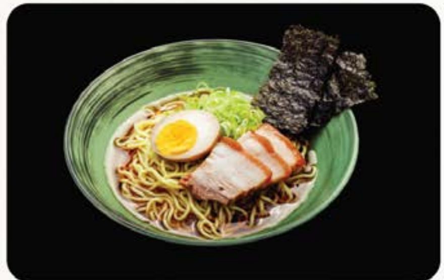
醤油ラーメン Shoyu Ramen Japanese ramen noodle with hot Japanese soy sauce based soup 180

All prices are in thousand Rupiah and Subject to Prevailing Government Tax and Service Charge