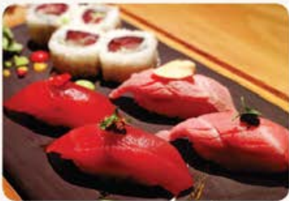
まぐろ鮭三味 Tuna Sushi Assortment assorted of tuna sushi & sushi roll 300