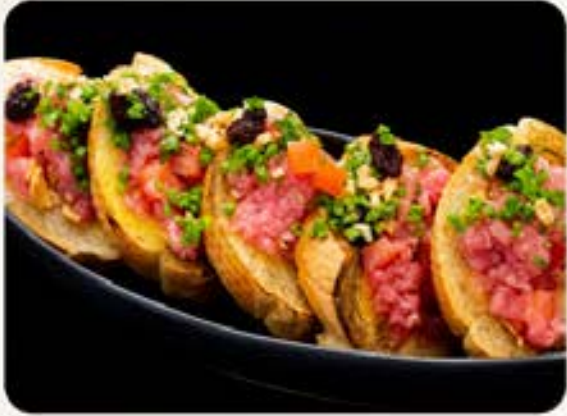
ねぎとろのバゲット添え Negitoro Bruschetta baguette with minced garlic tuna and Welsh onion leaves on top