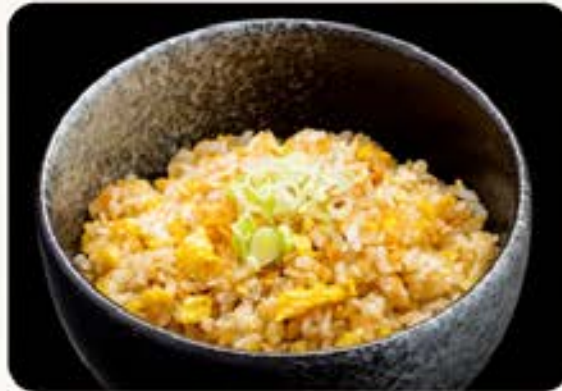
ガーリックライス Garlic Rice garlicky and buttery fried rice served with fried garlic 96