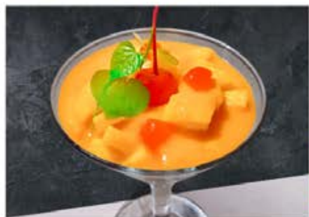
Mango Pudding マンゴプリン 84 mango pudding with fruits