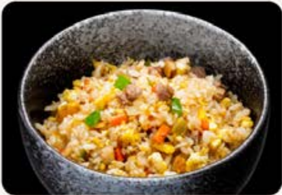
焼き飯 Yakimeshi Japanese fried rice 120