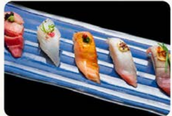
炙り鮭五貫盛合せ Assorted Seared Sushi assorted 5pcs of seared sushi 360