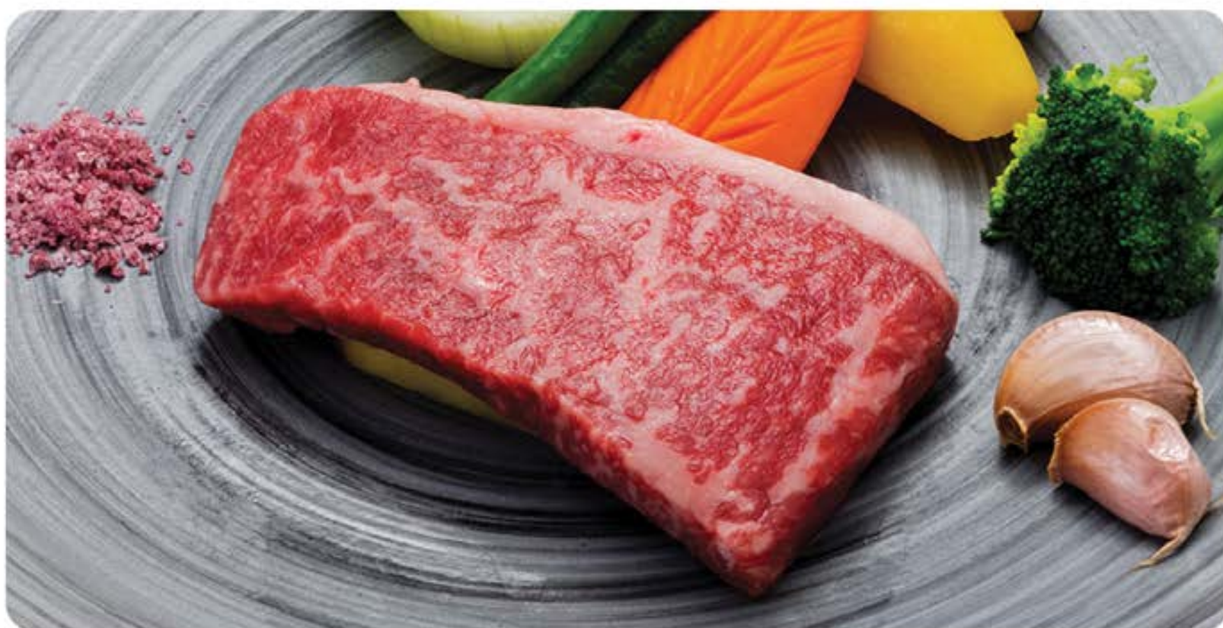
オーストラリア和牛のステーキ Aust. wagyu beef sirloin ..... 900