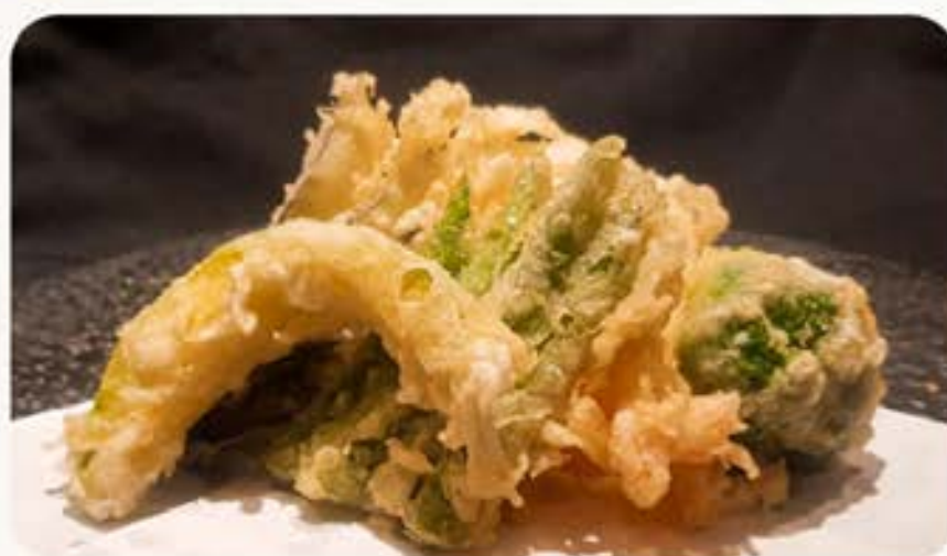
野菜天ぷら Vegetable Tempura