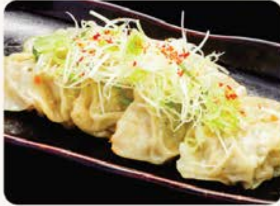
鶏・豚餃子 Chicken / Pork Gyoza Japanese dumpling with minced chicken or pork and vegetables filling