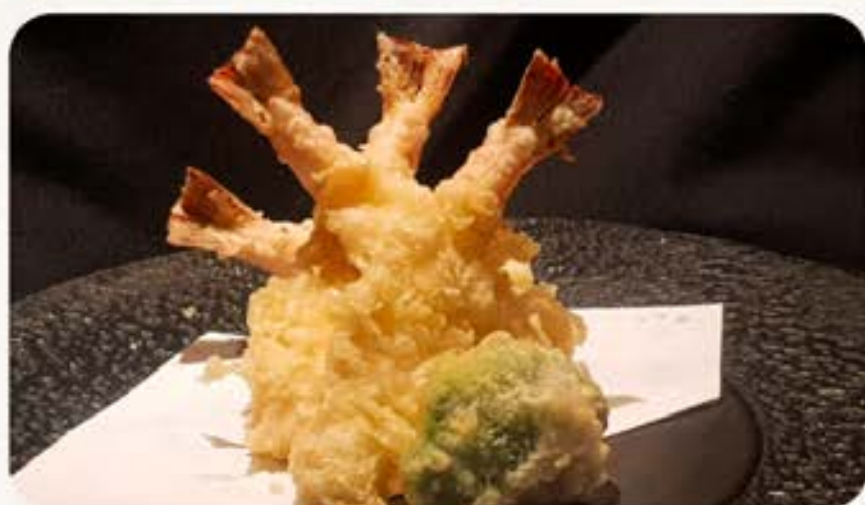
えび天ぷら Shrimp Tempura