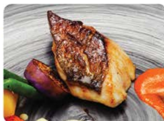
白身魚 Grilled White Fish Choice: salt / teriyaki / garlic / butter soy sauce 120

All prices are in thousand Rupiah and Subject to Prevailing Government Tax and Service Charge