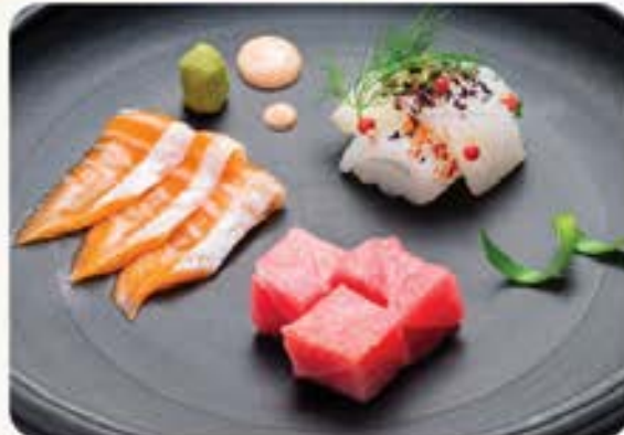
刺身三種盛合せ Assorted Sashimi 3 kinds 240