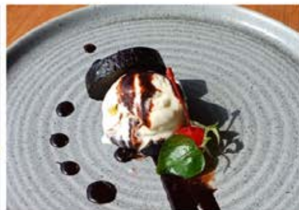
Gateau Chocolate & Ice Cream ガトーショコラアイスクリーム添え 96 chocolate gateau and cream