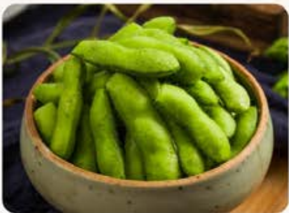
枝豆 Edamame green soybeans boiled in kelp stock