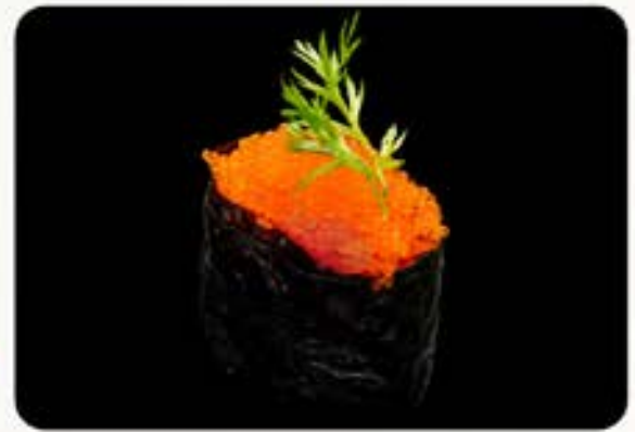
トビコ Tobiko 96