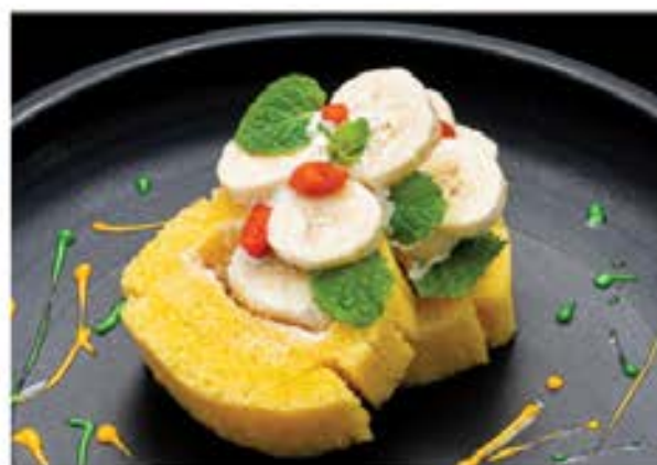
Komodo Roll Cake バナナロールケーキ レモンクリーム 60 banana roll cake with lemon cream