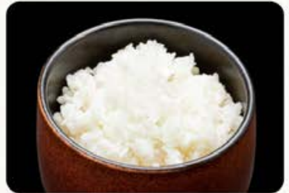
ごはん Steamed Rice steamed white rice 24

All prices are in thousand Rupiah and Subject to Prevailing Government Tax and Service Charge