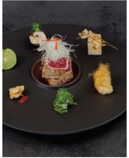
Maguro Steak grilled tuna steak IDR 180