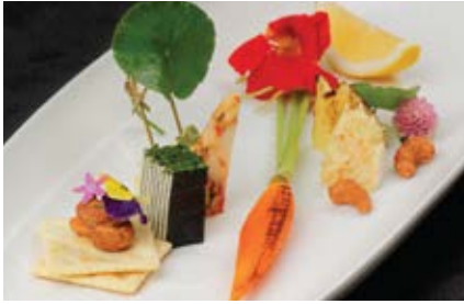
Cheese Moriawase various cheese assortment IDR 95