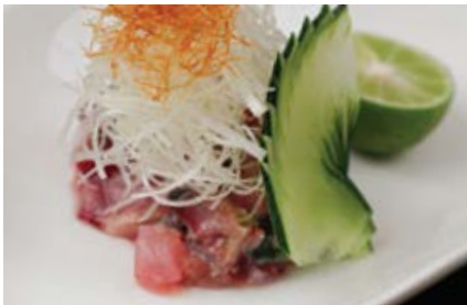
Aji no Namero minced fresh horse mackerel served with condiment IDR 60