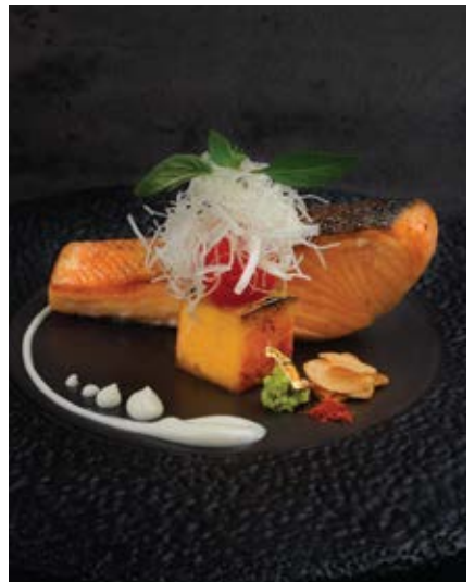
Grilled Salmon Choice: salt / teriyaki / garlic butter soy sauce IDR 300