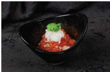
Ikura Oni Oroshi Ae salmon roe mixed with grated daikon raddish IDR 78