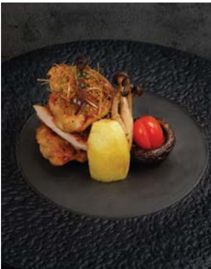
Grilled Chicken Choice: salt / teriyaki / garlic butter soy sauce IDR 130