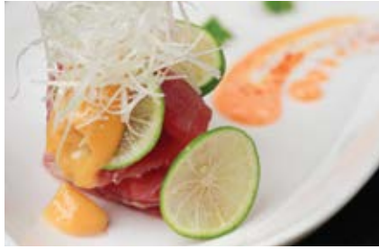
Maguro Sumiso Ae tuna with vinegar and miso sauce IDR 85