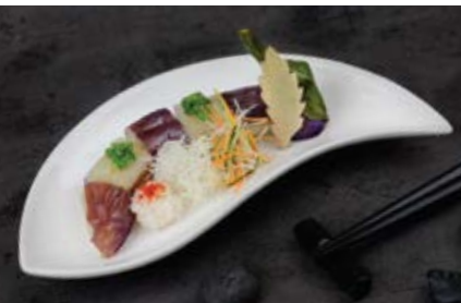
Age Nasu Nishiki Yasai Soe fried eggplant with with colorful vegetables IDR 50