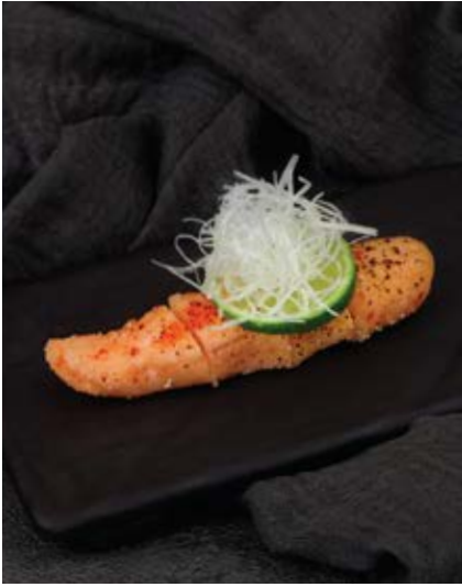
Aburi Mentai torched marinated roe IDR 65