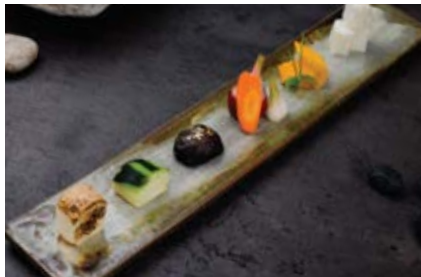
Tsukemono Moriawase assorted pickled vegetable IDR 50